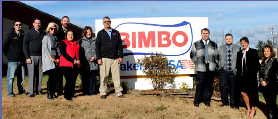
Bimbo Bakeries USA, Inc.