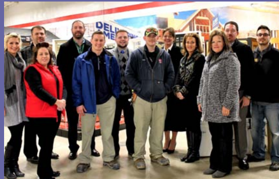
84 Lumber Company