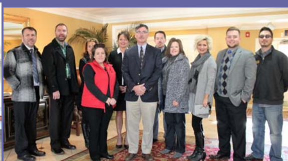
Bowling Funeral Home