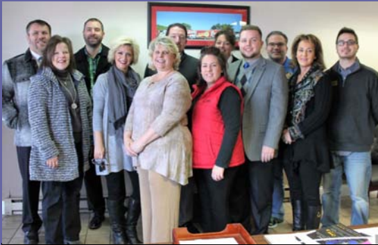
Borden Dairy of Kentucky

Be on the lookout. . . next month they might be visiting you!