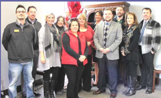
Highlands Diversified Services, Inc.