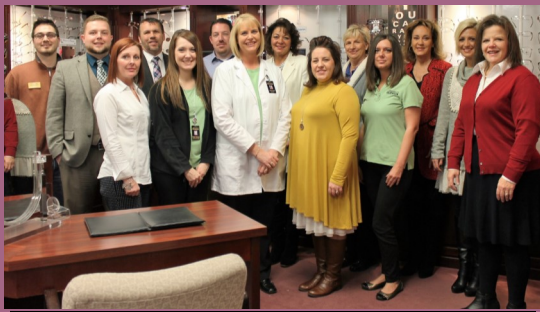
Professionals in Eye Care Located at 356 McWhorter Street