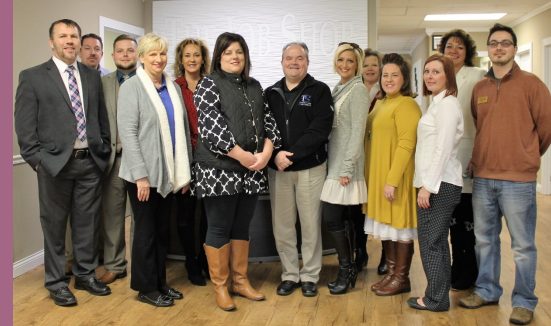
The Job Shop Staffing Services Located at 85 South Laurel Road