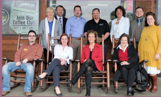
Ott's General Store Located at 21 Hawk Creek Road

Be on the lookout. . . next month they might be visiting you!