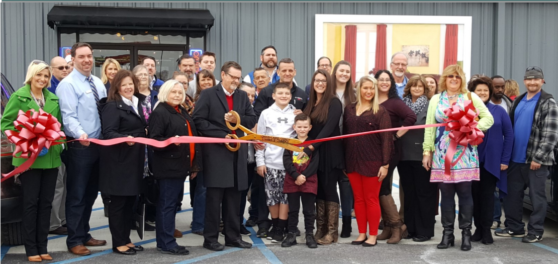
CC's Furniture Located at 1758 Hwy 192 West