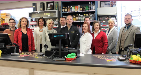
Buddy's Liquor Located at 1574 South Main St.