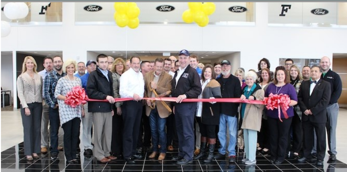
Don Franklin Ford Located on the 192 By-Pass