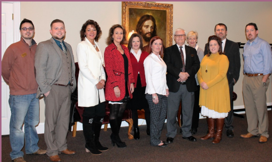
London Funeral Home Located at 879 South Main Street