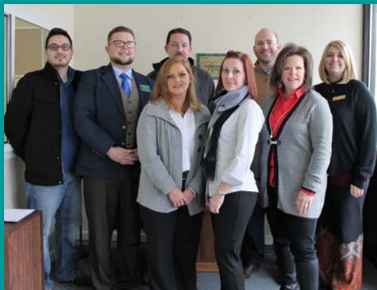
Universal Linen Service