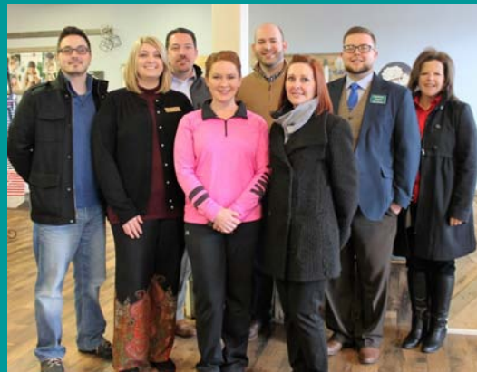
Club Store Select