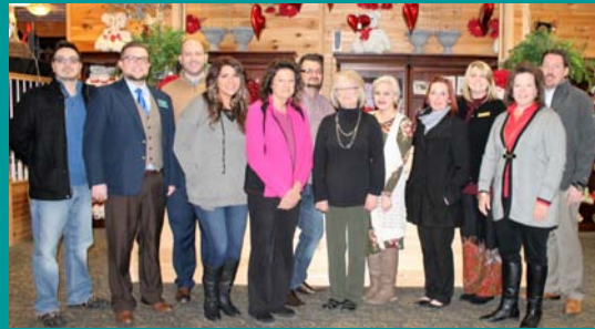
The White Lily Florals & Gifts