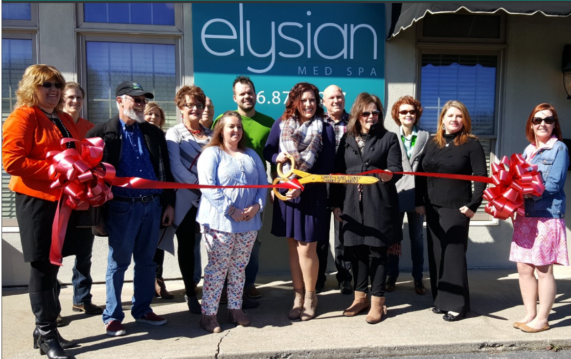
Elysian Med Spa is located at 1501 West 5th Street