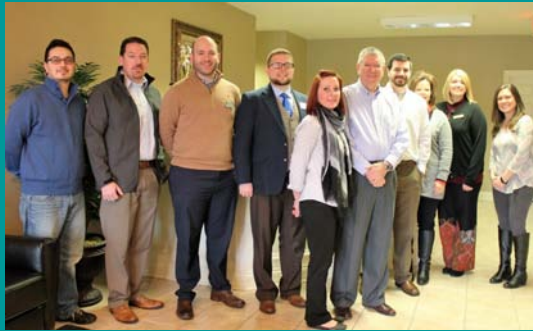
Christian Sturgeon & Assoc.

Be on the lookout. . . next month they might be visiting you!