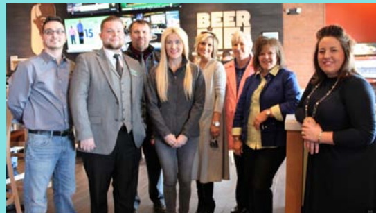
Buffalo Wings & Rings Located at 201 Faith Assembly Church Rd.