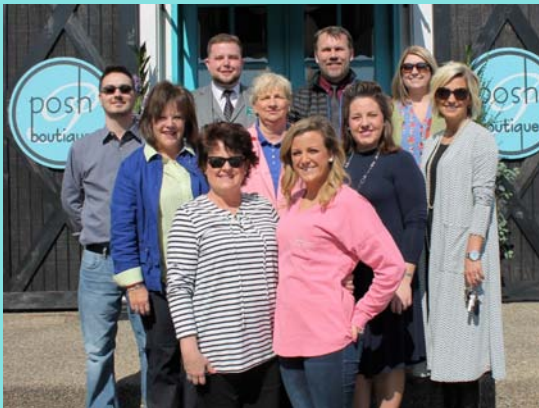
Posh Boutique Located at 530 Keavy Road