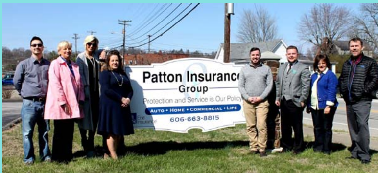
Patton Insurance Group Located at 834 East 4th Street