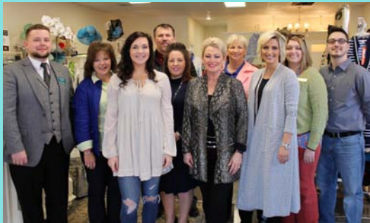
Paperdolls Located at 1340 South Laurel Road

Be on the lookout. . . next month they might be visiting you!