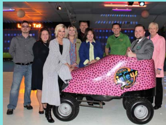
Finley's Fun Center Located at 85 South Laurel Road