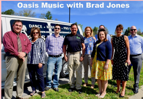
Oasis Music Entertainment 606-878-0334