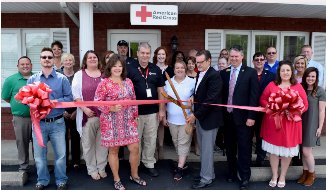
American Red Cross—Southeastern KY Located at 107 CVB Lane