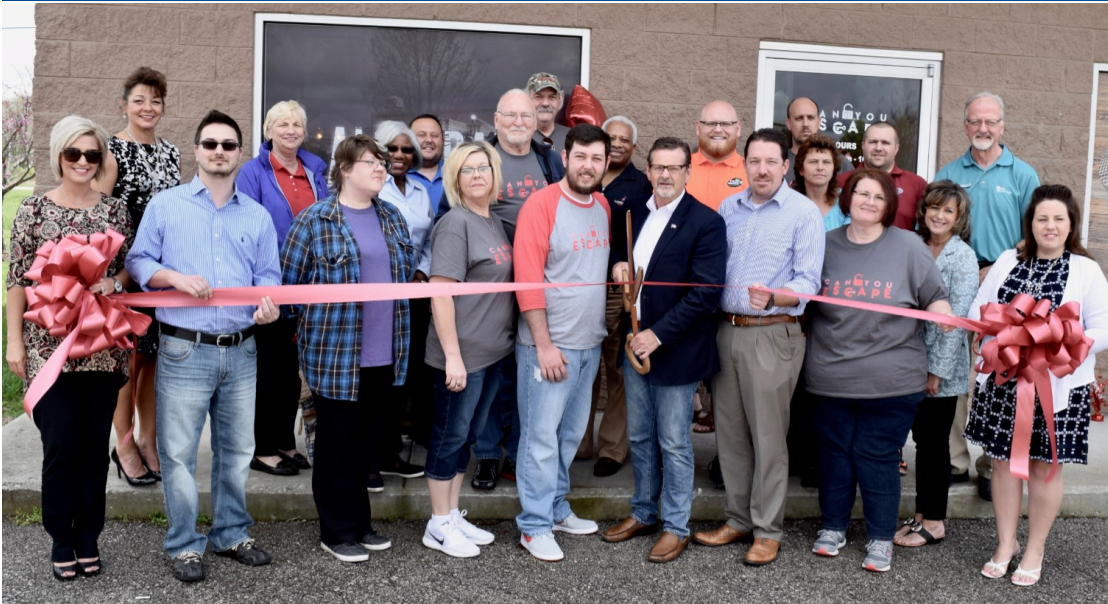
Can You Escape Located at 219 Commercial Drive Suite 1