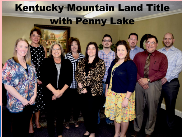
Kentucky Mountain Land Title with Penny Lake