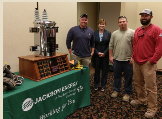
Jackson Energy's Rodeo Champions

The Chamber would like to thank the following businesses that donated prizes at our October luncheon. . .