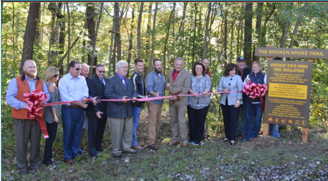
The Broken Spoke Trail Located in Levi Jackson State Park