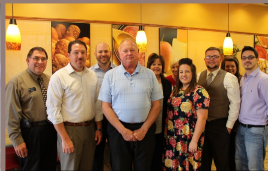
T & W Ventures DBA Subway