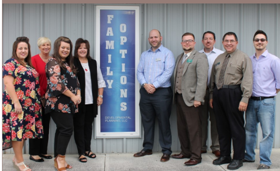
Family Options- Developmental Planning