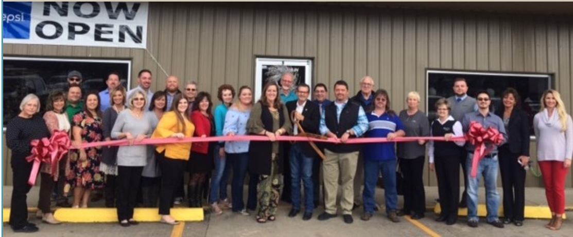
Maple Leaf Furnishings Located at 1226 South Main Street