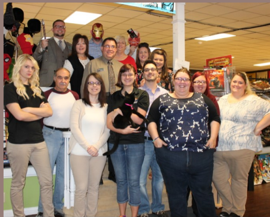
Mad Ox Games & Comics