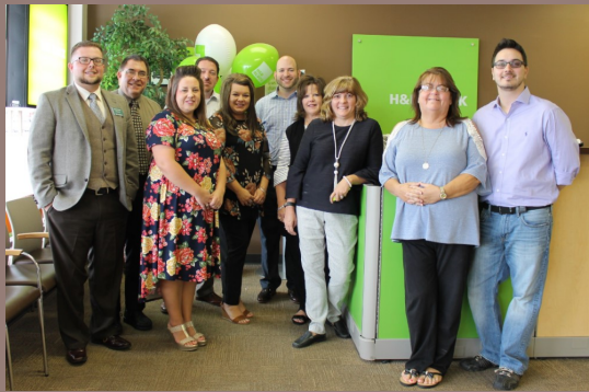
H&R Block Income Tax

Be on the lookout. . . next month they might be visiting you!