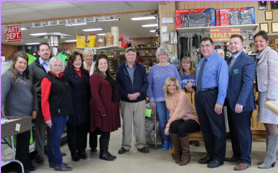
Benge Farm Supply

Be on the lookout. . . next month they might be visiting you!