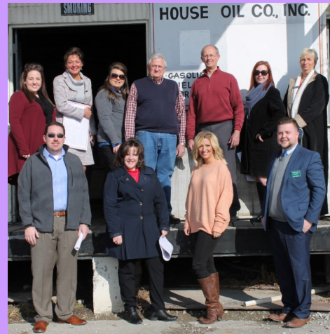
House Oil Co. Inc.