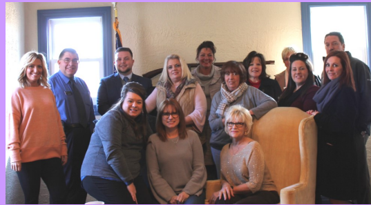
USA Realty, Inc.