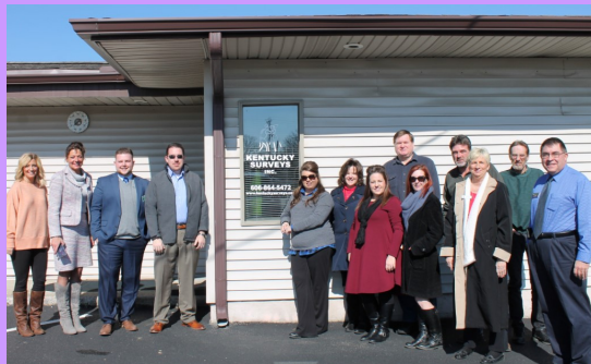
Kentucky Surveys, Inc.