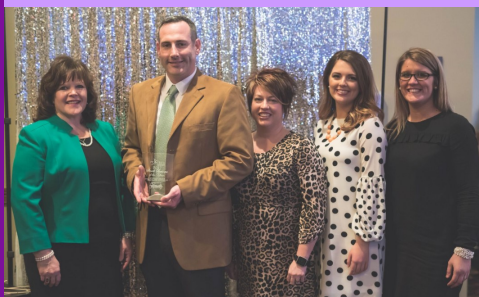
PT Pros, Inc.