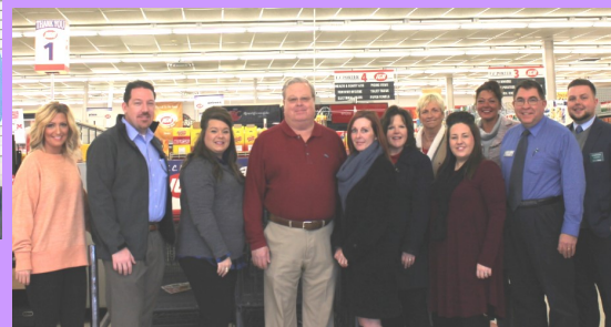
E. C. Porter Store, Inc.