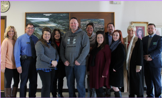
London Corbin Airport