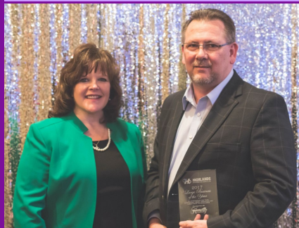
Highlands Diversified Services, Inc.