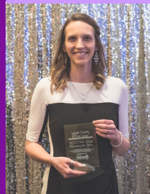
Laurel County Life Center