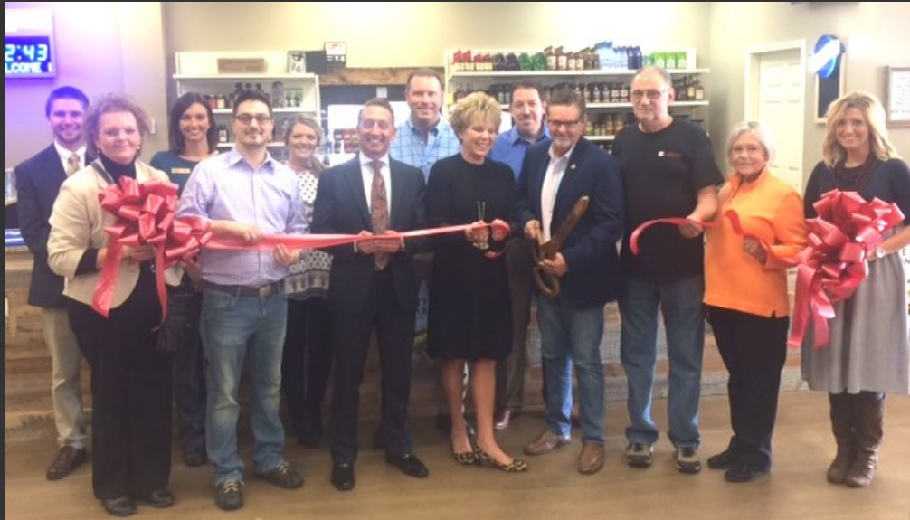
41 Liquors is located at 79 Bravo Lane in Shiloh Landing