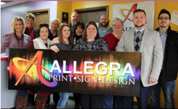
Allegra Print Sign Design

Be on the lookout. . . next month they might be visiting you!