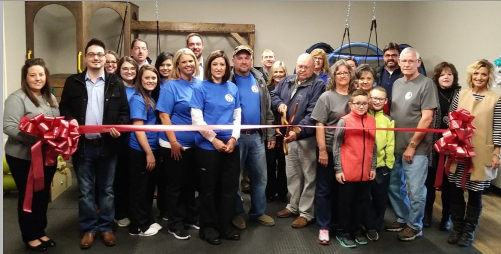
Alexander & Associates, LLC Located at 212 Thompson Poynter Road