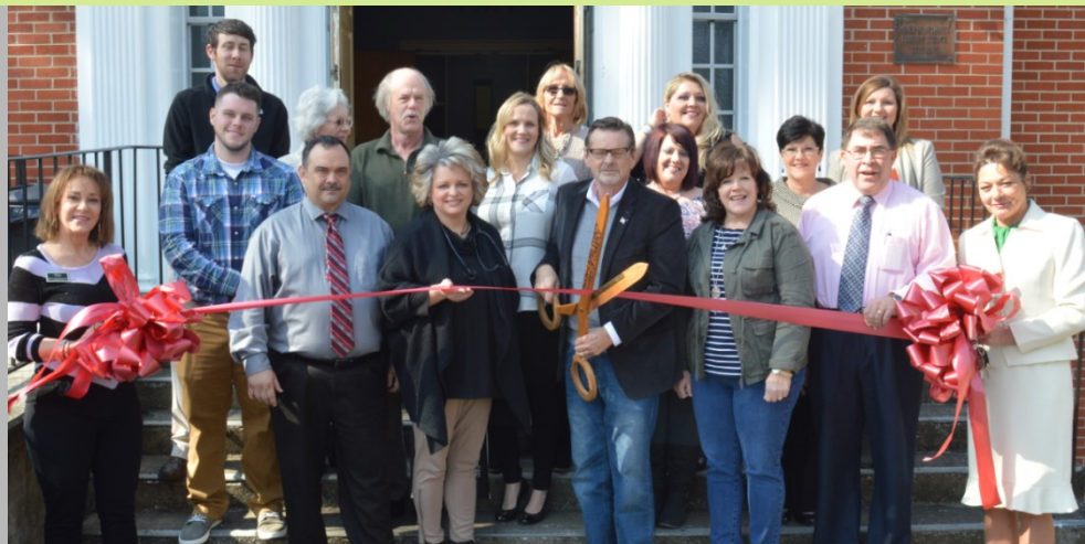
New Hope Counseling and Recovery Located at 60 Bennett Circle Drive