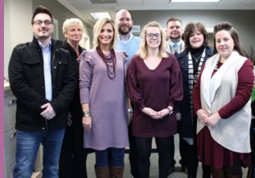
Mountain Valley Insurance