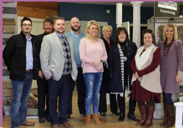
Tri-State Wholesale / Elk Run