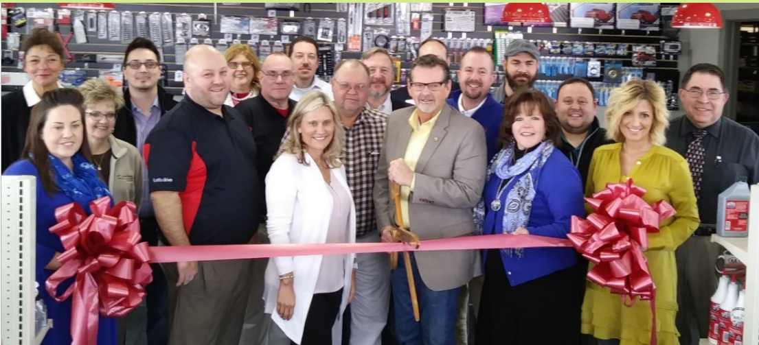
Legacy Auto Parts Located at 792 S. Laurel Road