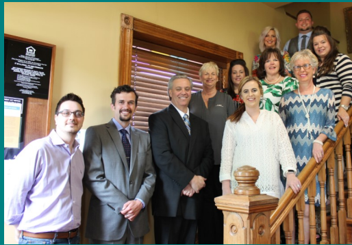
First National Bank of Manchester

Be on the lookout. . . next month they might be visiting you!