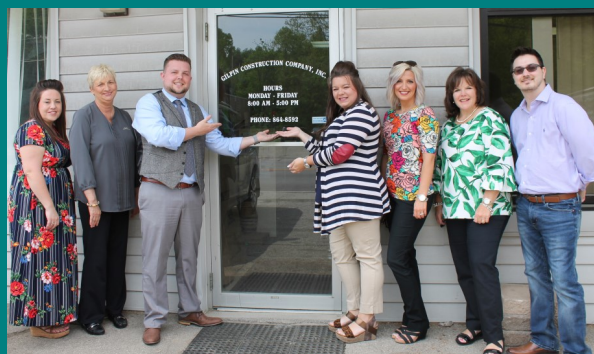
Gilpin Construction Company, Inc.