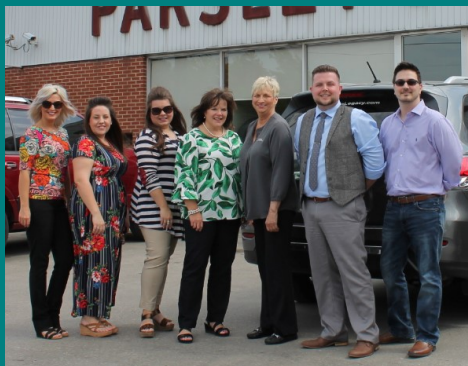
Parsley's General Tire Inc.