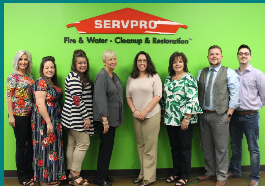
Servpro of Pulaski & Laurel Co.