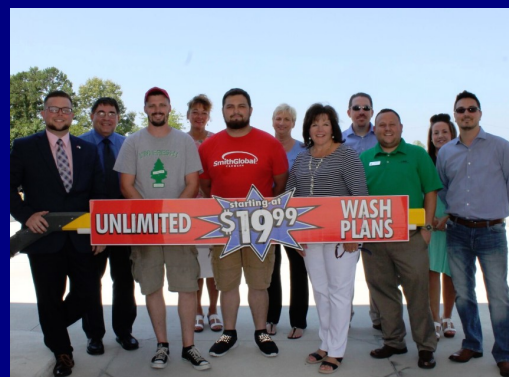
Smith Global Car Wash