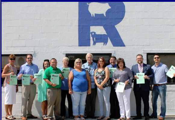
Robinson's Premium Meats