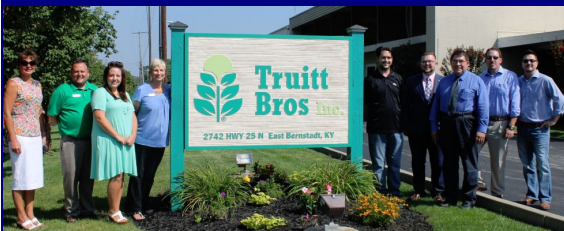
Truitt Bros. Inc.