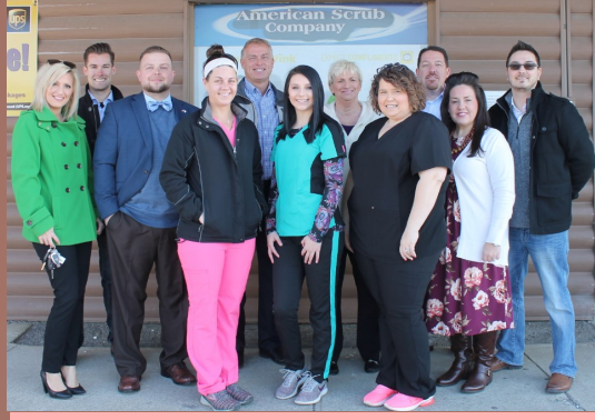
American Scrub Company 150 Dog Patch Trading Center