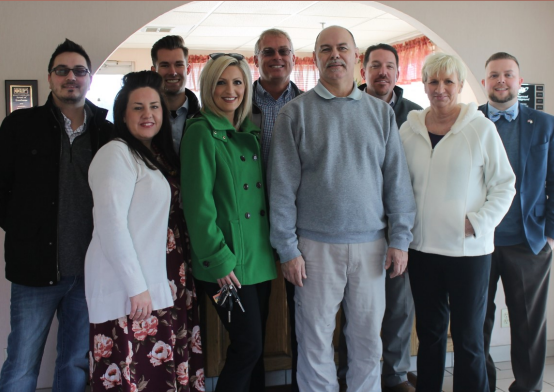
Budget Host Westgate Inn 254 Russell Dyche Mem. Hwy & Bravo Lane