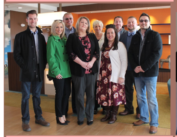
Fairfield Inn & Suites 201 Shiloh Drive