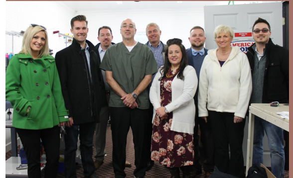
American Embroidery 150 Dog Patch Trading Center