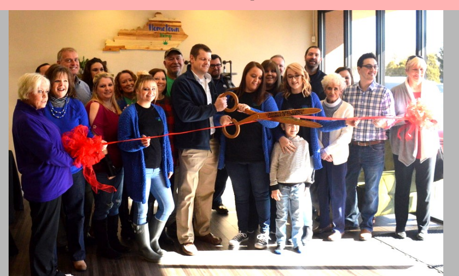
Hometown Hemp Located at 1750 Hwy 192 West, Suite 3