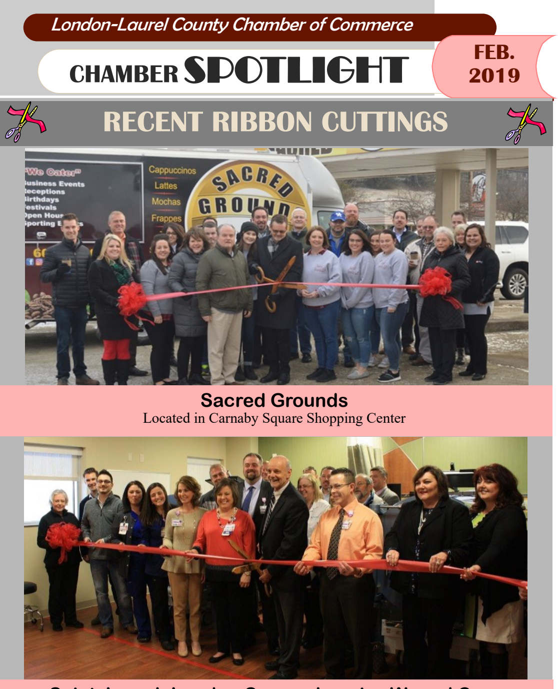
Saint Joseph London Comprehensive Wound Care Located at 1001 Saint Joseph Lane, 6th Floor