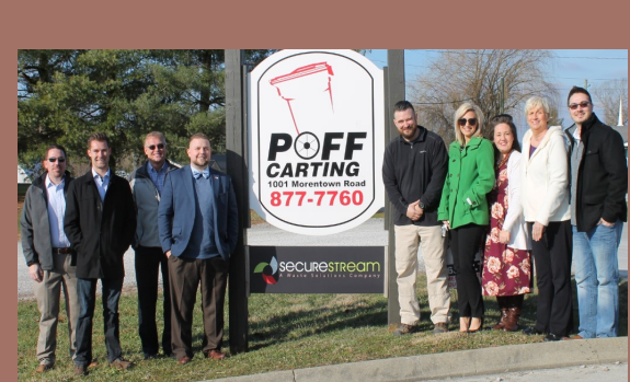
Secure Stream 1001 Morentown Road