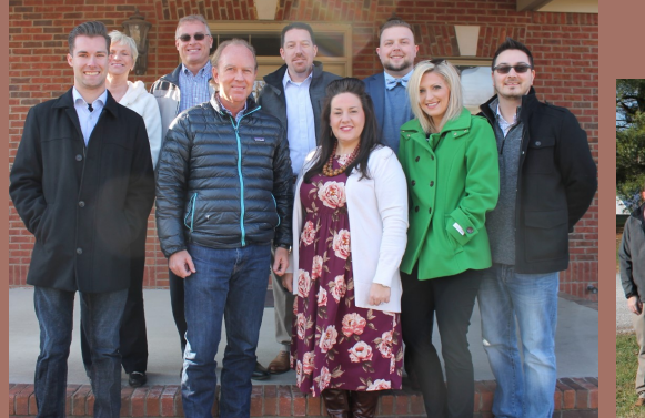
ATS Construction 761 Morentown Road

The Chamber Ambassadors continued their "patrol" last month and surprised six of our members with balloons and cookies in hand. Each business was also presented a "free lunch" certificate to our general membership luncheon. The purpose of the Ambassador Patrol is to let our members know that we appreciate their commitment and support of our Chamber and to encourage further participation in Chamber events.