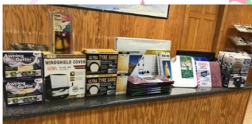
Daily Door Prize Drawings!

Thursday and Friday: 8am - 6pm Saturday: 9 am - 5 pm Sunday: 12 pm - 5 pm