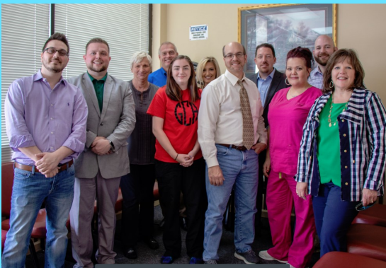
Laurel County Chiropractic 164 London Shopping Center