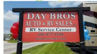
Free Lunch Every Day At 1!

We'll stay open until the last customer leaves!