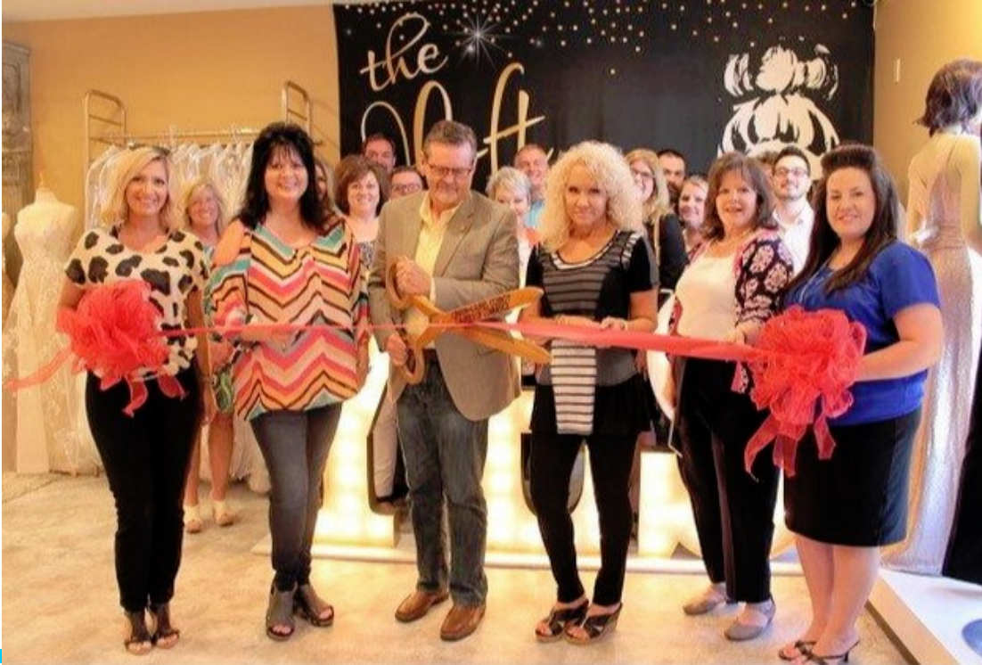
The Loft of London LLC Located at 94 Dog Patch Trading Center, Suite 1