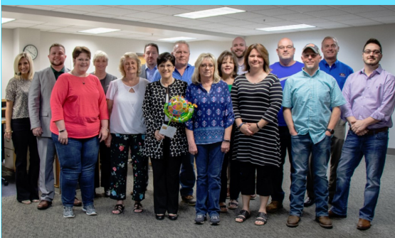
Laurel County PVA Office 101 South Main Street, Room 127