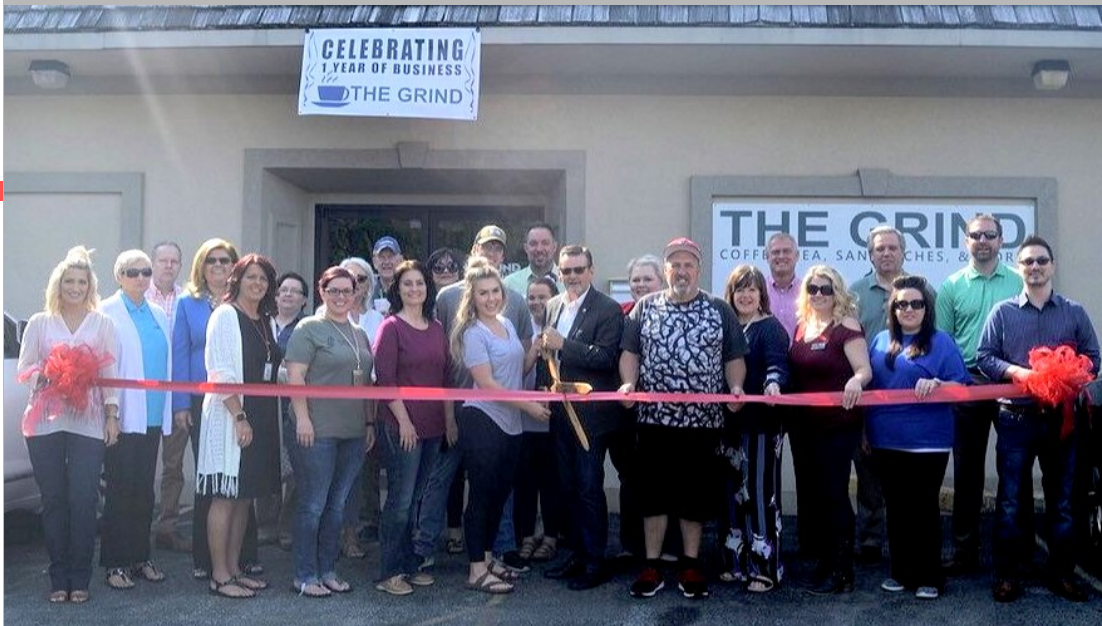
The Grind Coffee Shop Located at 202 East 4th Street