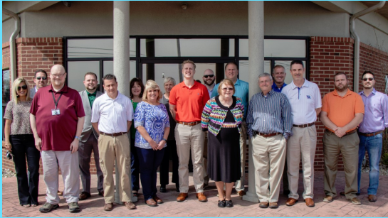
Information Capture Solutions, LLC 25 Airpark Drive

Be on the lookout. . . next month they might be visiting you!