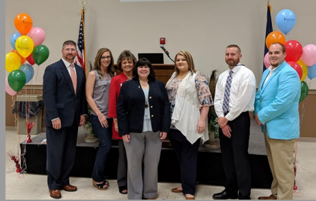
Staff of Transamerica Agency Network