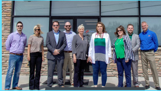
First Care Clinics 1649 Hwy 192 West