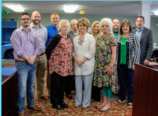
Laurel Financial Company 1108 South Main Street