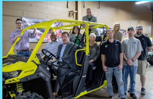
Adrenaline Cycles Co. LLC 600 South Laurel Road