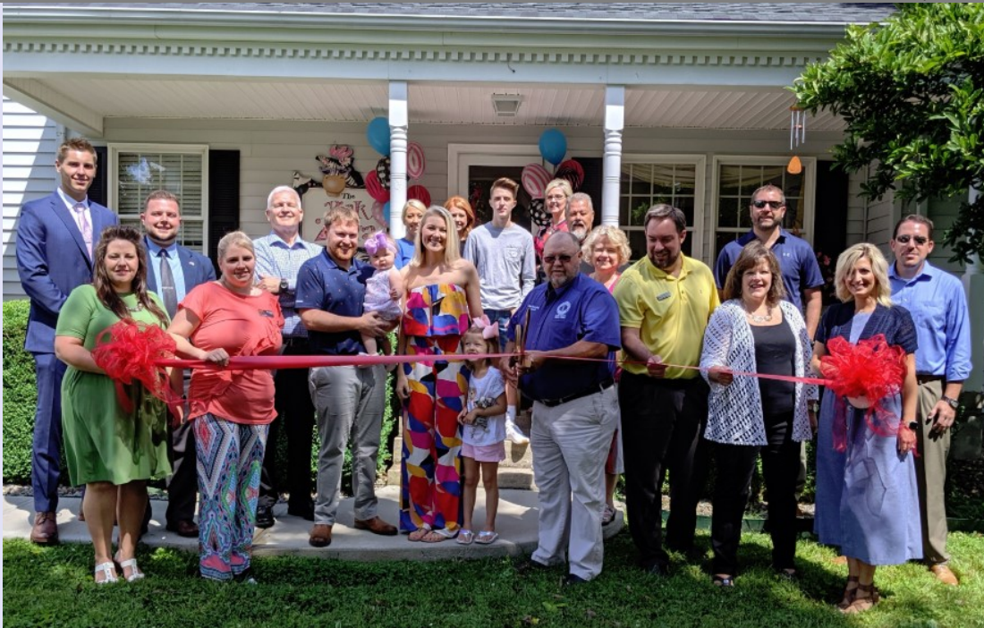
The Pink Zebra Children's Boutique Located at 506 Keavy Road