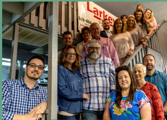
Larkey HVAC 833 North Hill Street