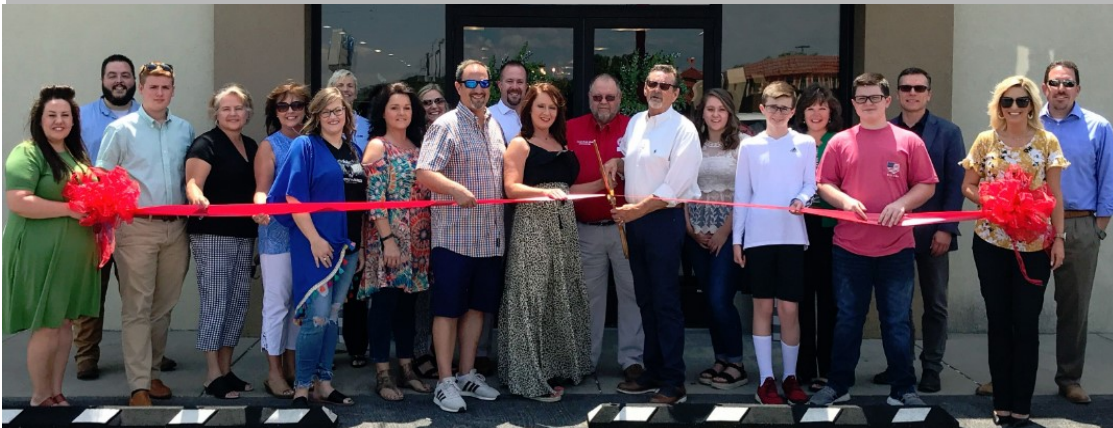
Gypsy & James Boutique Located at 1752 Hwy 192 West, Suite 2