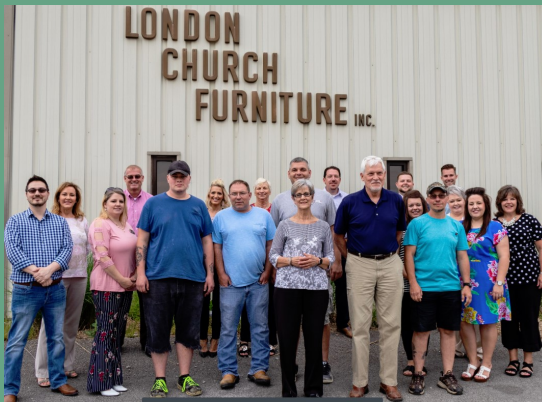
London Church Furniture, Inc. 345 Sinking Creek Rd.