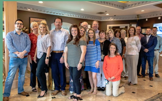
Senture, LLC 460 Industrial Boulevard