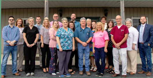
Animal House Veterinary Clinic 123 Robinson Road

Be on the lookout. . . next month they might be visiting you!