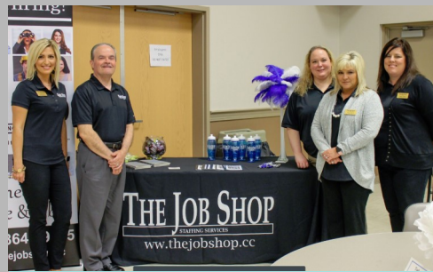
Staff of The Job Shop Staffing Services