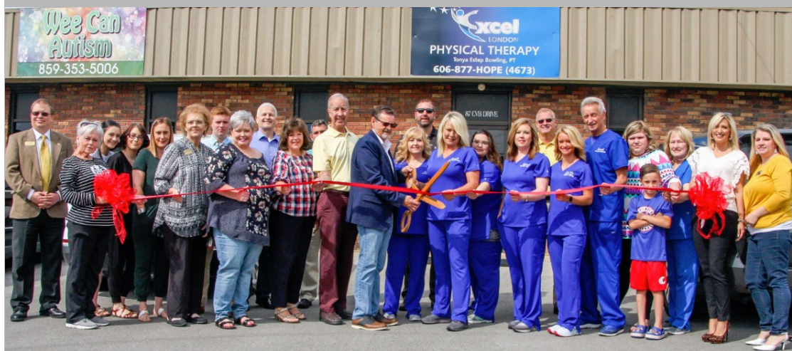
Excel Physical Therapy Located at 87 CVB Drive