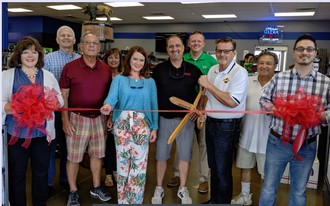
Starr's Liquor Located at 700 Caudill Lane