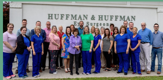
Huffman & Huffman, P.S.C. 503 North Main Street