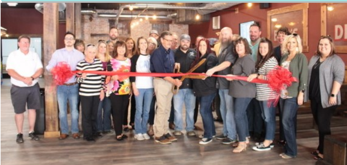
Dreaming Creek Brewery Located at 121 North Main Street