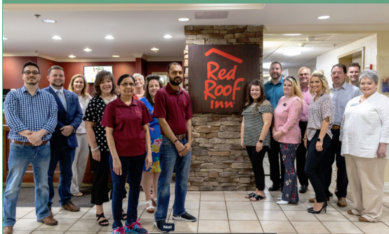
Red Roof Inn 110 Melcon Lane