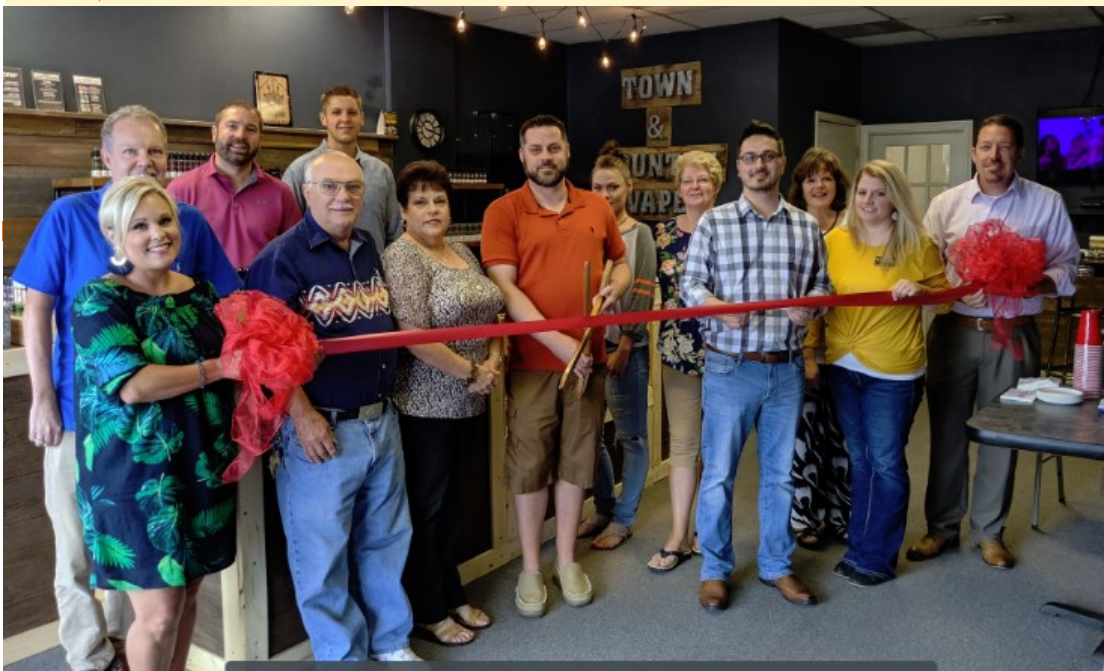
Town & Country Vape Located at 1501 South Main Street, Suite J