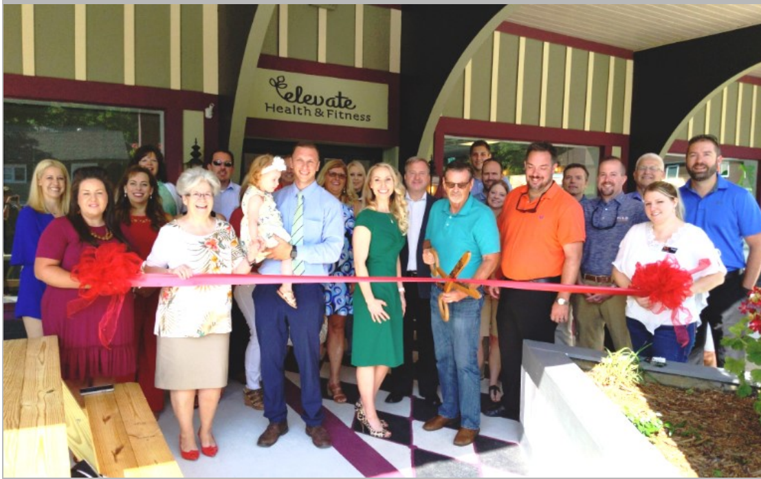
Elevate Health & Fitness Located at 203 North Hill Street