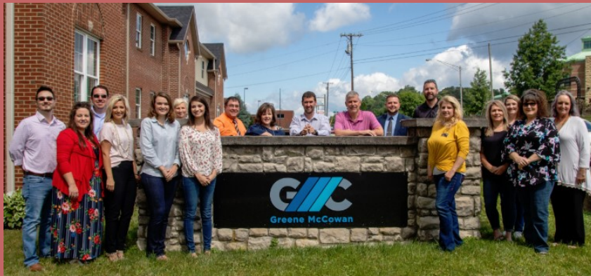
Greene, McCowan & Co., PLLC 605 North Main Street

Be on the lookout. . . next month they might be visiting you!