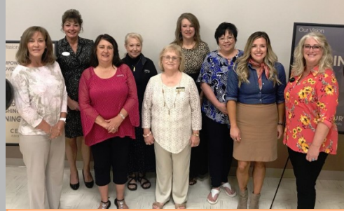
Century 21 Realtors