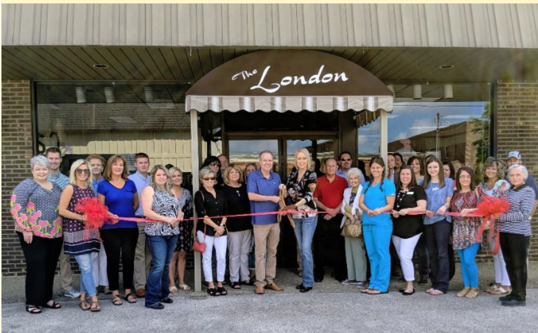
The London Gifts & Accessories Located at 202 North Hill Street