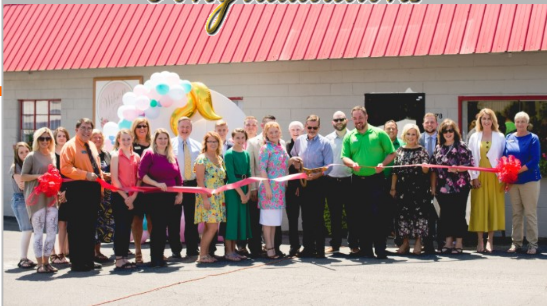
Wilson & Co. Designs Located at 1378 South Laurel Road