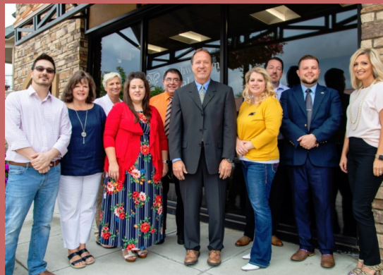
Northwestern Mutual 322 North Main Street, Suite 100