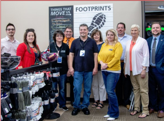
Shoe Sensation 103 London Shopping Center