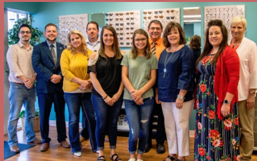
Professionals in Eye Care 356 McWhorter Street, Suite 1