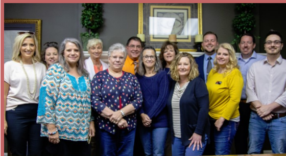
Napier & Associates, P.S.C. 300 West 5th Street