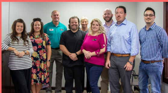
Select Lab 140 East 4th Street