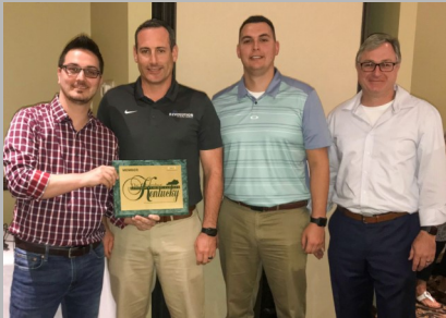
Revolution Physical Therapy