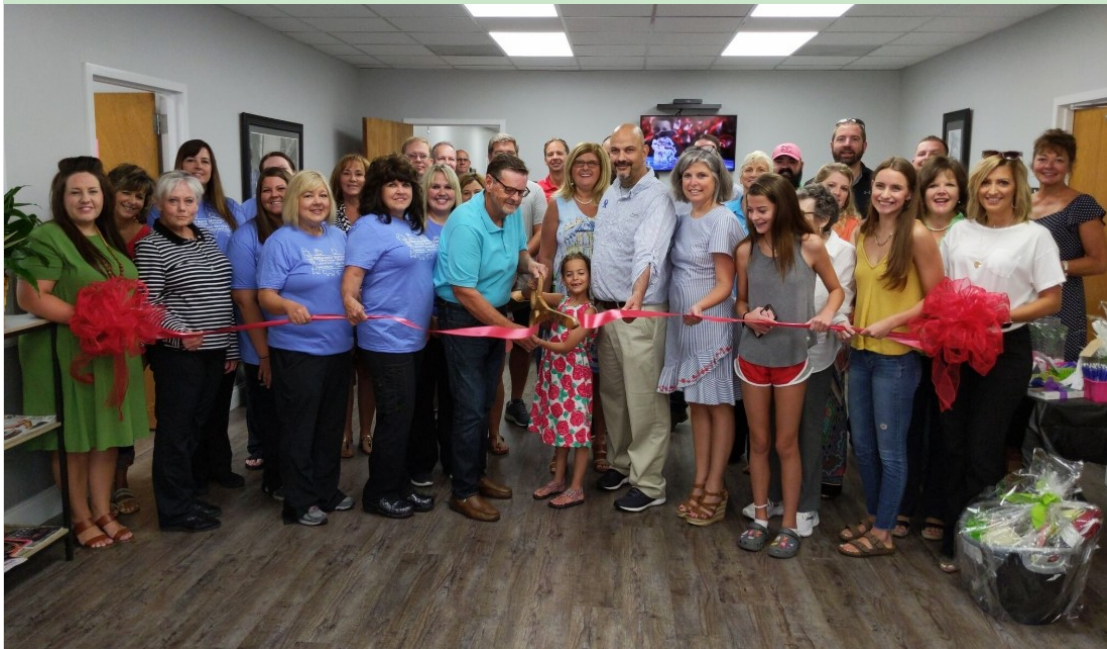
Herren Family Dentistry Located at 823 South Main Street