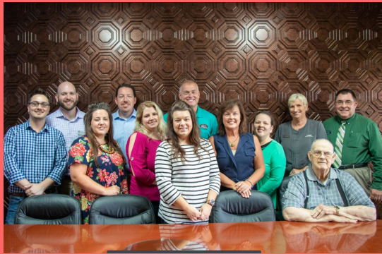
London-Laurel County Industrial Development Authority 4598 Old Whitley Road

Be on the lookout. . . next month they might be visiting you!