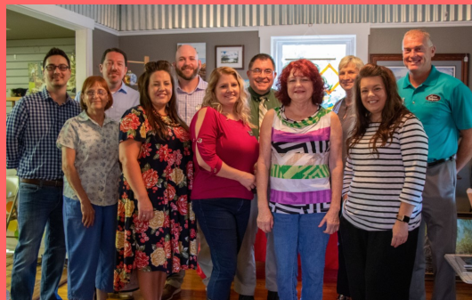
Mountain Heritage Artisans Guild 1006 West 5th Street