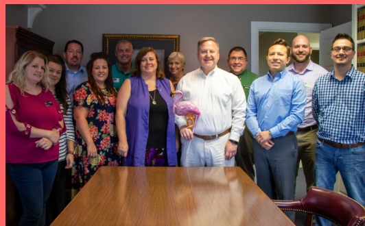
Tooms, Dunaway & Webster, PLLC 1306 West 5th Street