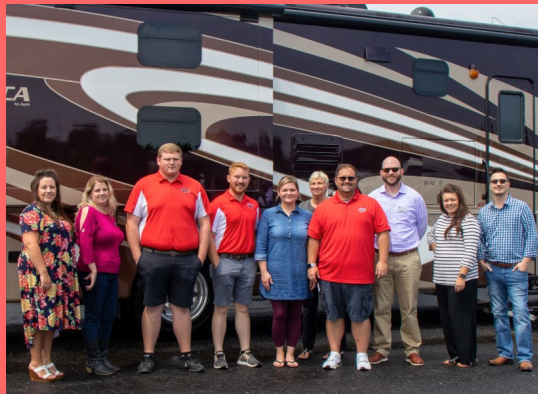
Day Bros RV Sales 3054 South Laurel Road