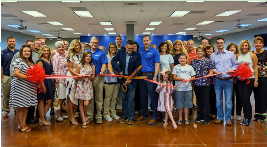
Revolution Physical Therapy Located at 195 Commercial Drive, Suite 2