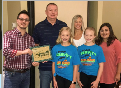
Air Raid Trampoline Park