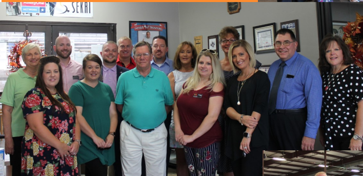
Surplus Sales, Inc.