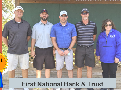
First National Bank & Trust