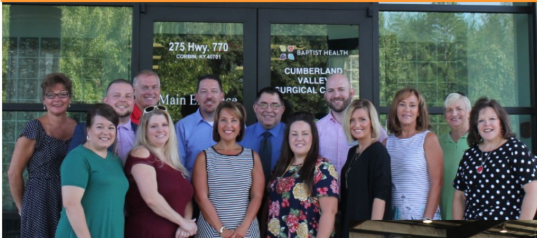
Cumberland Valley Surgical Center

Be on the lookout. . . next month they might be visiting you!