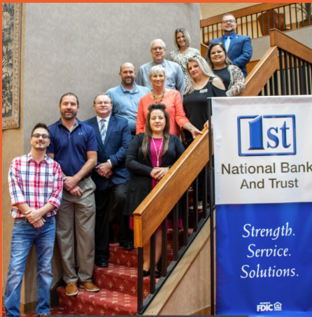
First National Bank and Trust

Be on the lookout. . . next month they might be visiting you!