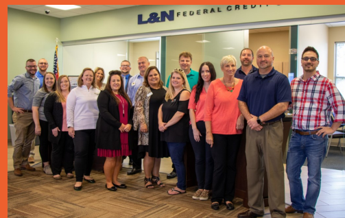
L&N Federal Credit Union