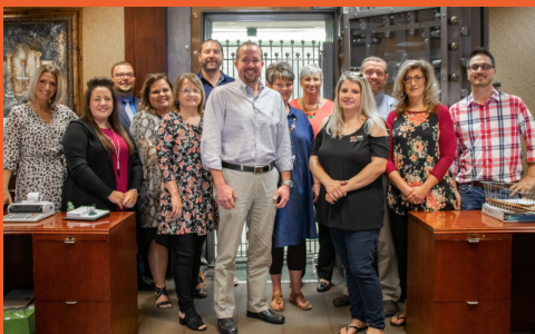
Cumberland Valley National Bank & Trust