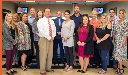
1st Trust Bank