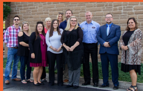
Community Trust Bank