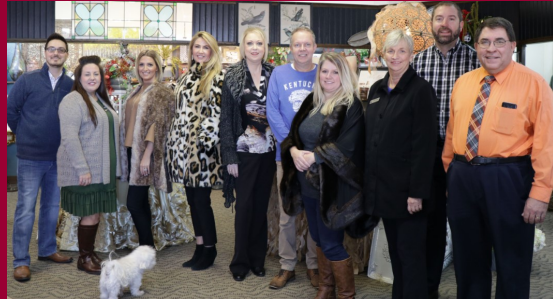
The London Gifts & Accessories 202 North Hill Street