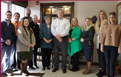
Flowers Bakery of London 501 East 4th Street