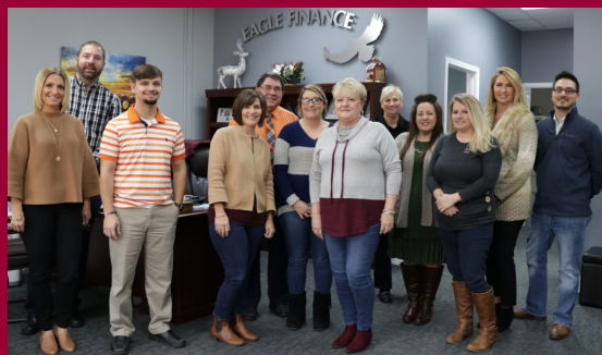
Eagle Financial Services 1744 West Hwy 192