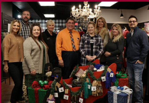
Gypsy & James Boutique 1752 West Hwy 193, Suite 2