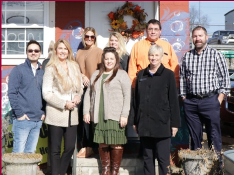
Rock Bottom Soap 429 East 4th Street

Be on the lookout. . . next month they might be visiting you!