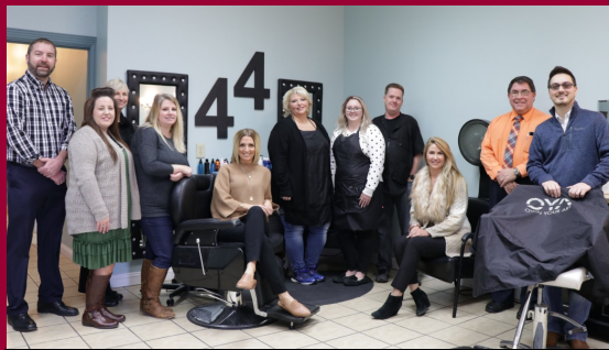
Salon 44 1728 West Hwy 192