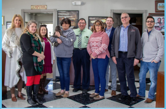
London Auto Sales 4550 Somerset Road