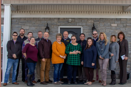
Ford Brothers Inc. Auctioneers-Realtors 64 Keavy Road, Suite 1