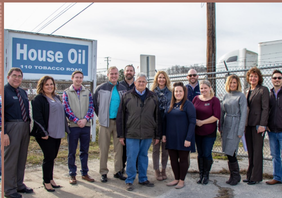
House Oil Company Inc. 110 Tobacco Road