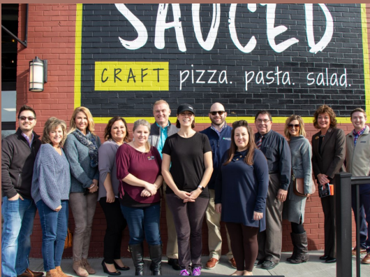
Sauced Craft Pizza, Pasta & Salad 202 South Broad Street