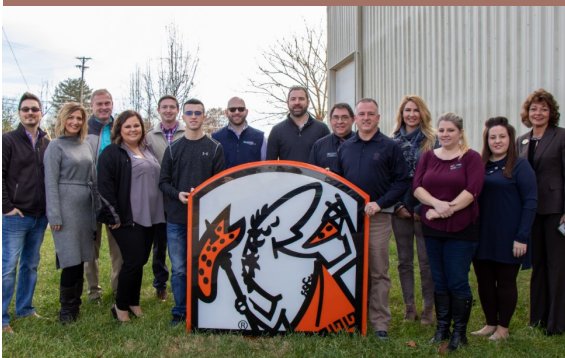
Little Caesars Pizza/MRK Enterprises 808 South Main St. / 1000 East 4th Street