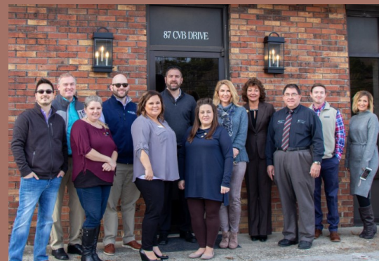
Excel Physical Therapy 87 CVB Lane