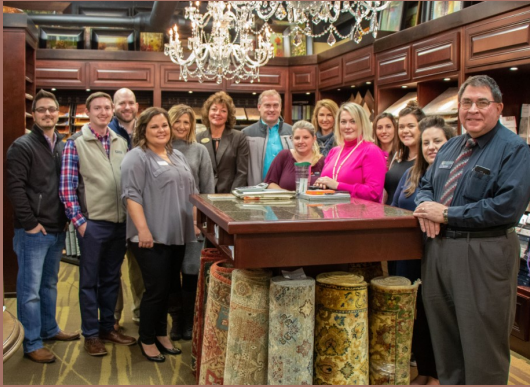
Ryser's Flooring, Inc. 210 North Broad Street

The Chamber Ambassadors continued their “patrol” last month and surprised six of our members with lots of goodies in hand. Each business was also presented a “free lunch” certificate to our general membership luncheon. The purpose of the Ambassador Patrol is to let our members know that we appreciate their commitment and support of our Chamber and to encourage further participation in Chamber events.