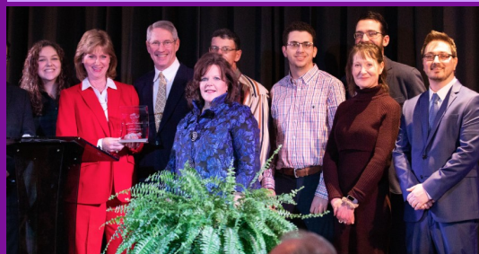
Kentucky Sign Center