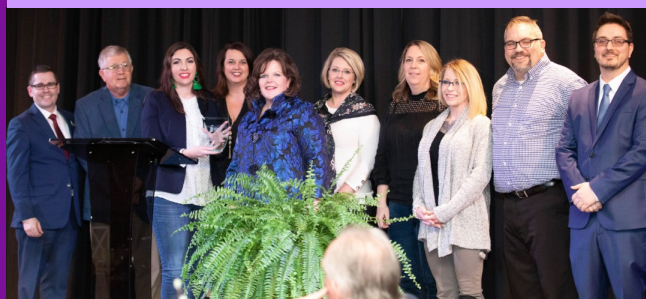
Backpack Program of Laurel County