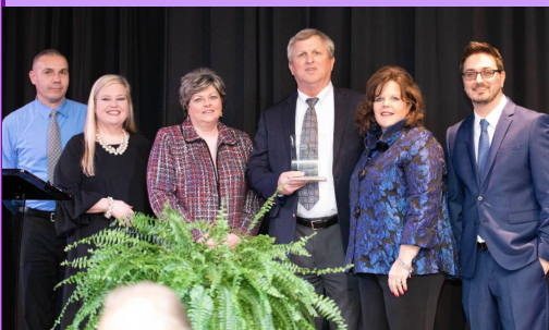
Flowers Bakery of London