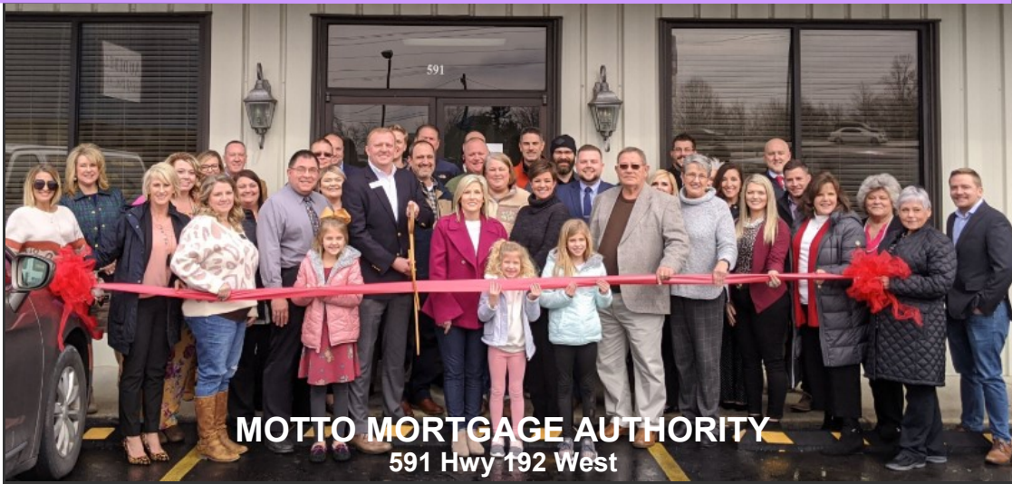
MOTTO MORTGAGE AUTHORITY 591 Hwy 192 West