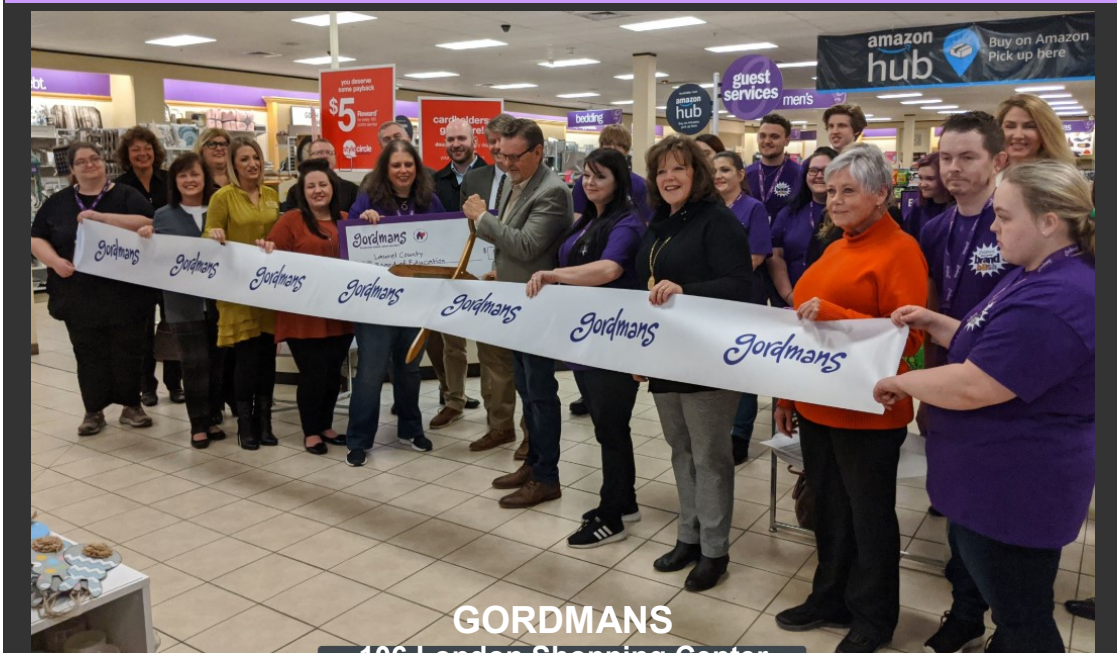
GORDMANS 106 London Shopping Center