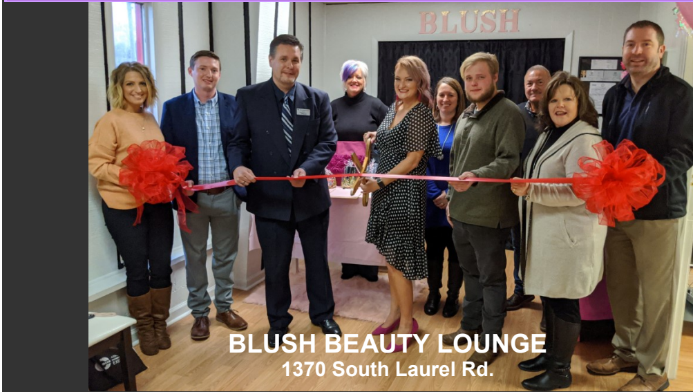
BLUSH BEAUTY LOUNGE 1370 South Laurel Rd.