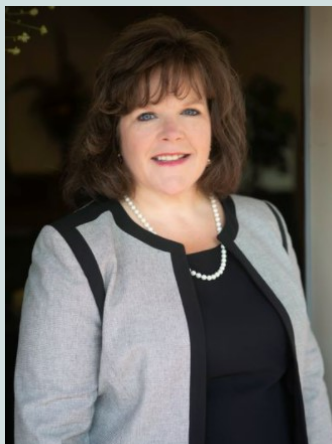
2020 Chamber Executive of the Year