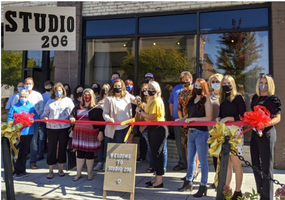
Studio 206 Luxury Photography Located at 206 North Main Street