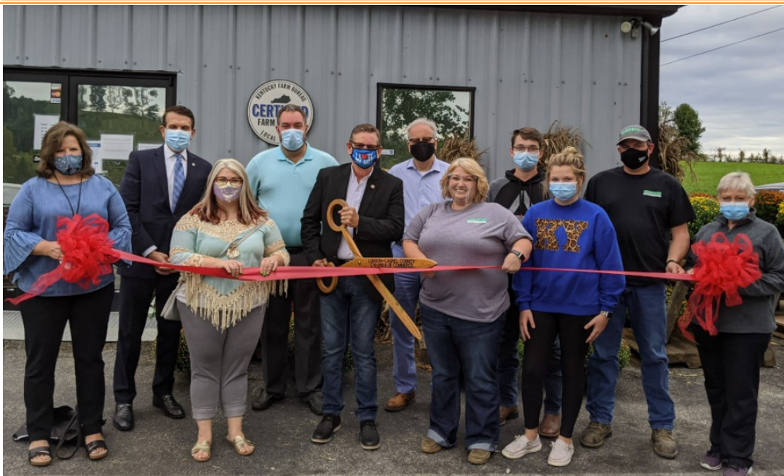
Cornett Farm Fresh Located at 630 Bill George Road