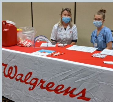
Thank you to Walgreens for coming to give flu shots.