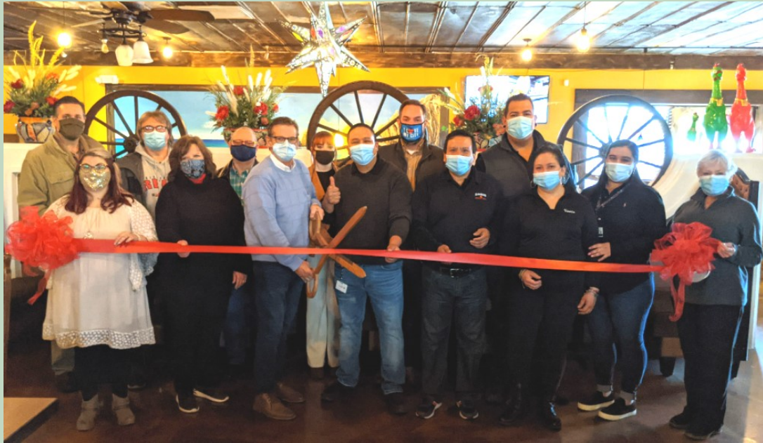
Habanero Mexican Grill Located at 41 Shiloh Drive