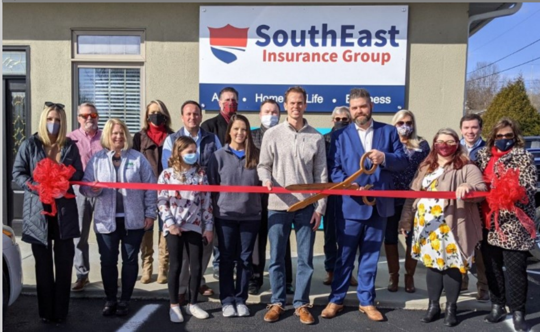
SouthEast Insurance Group Located at 1501 West 5th Street in London