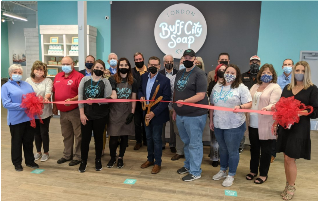
Buff City Soap Located at 1698 US Hwy 192