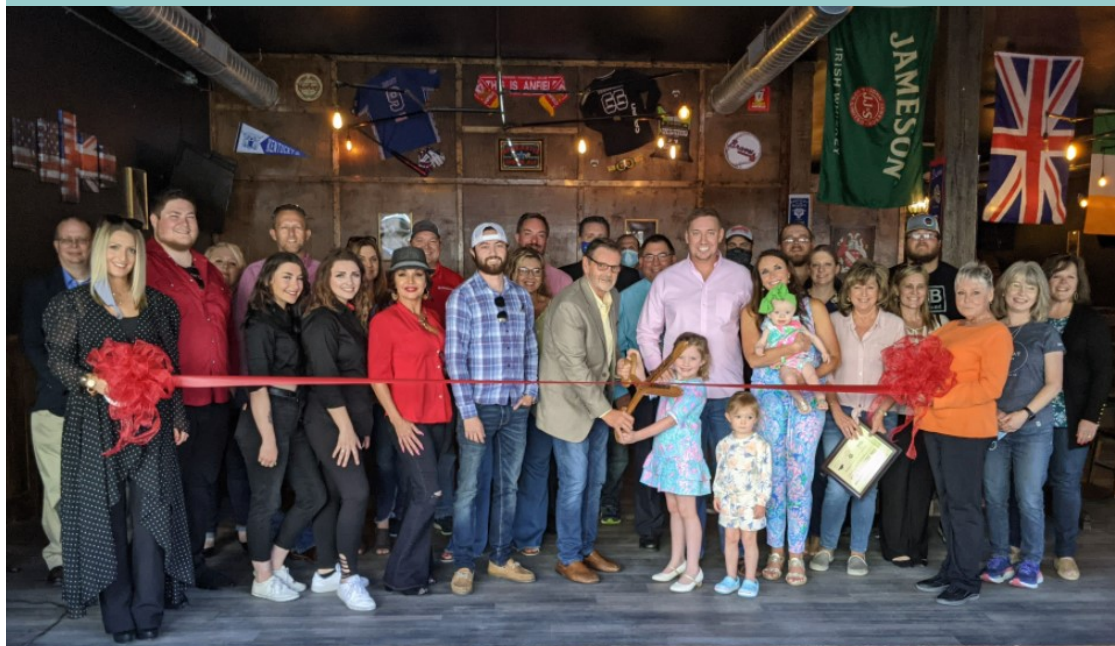
The Butcher's Pub Located at 121 North Main Street