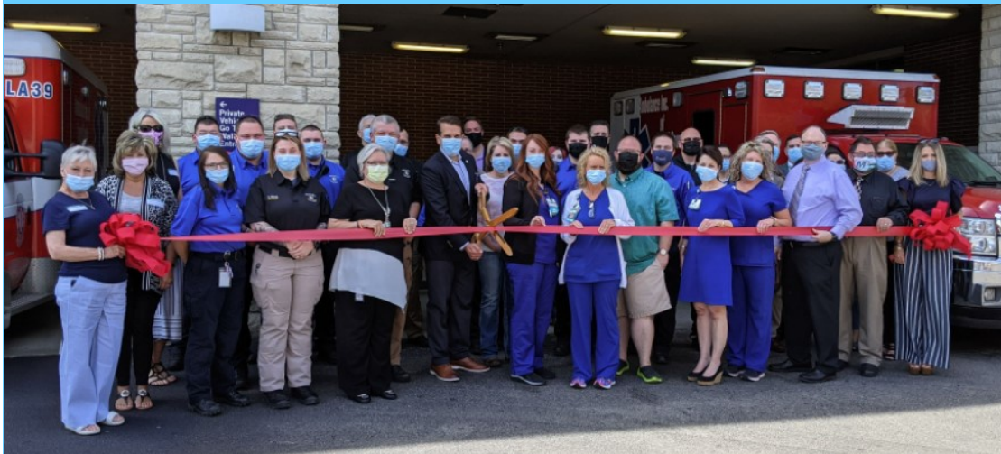
New EMS Lounge at Saint Joseph London Located at 1001 Saint Joseph Lane