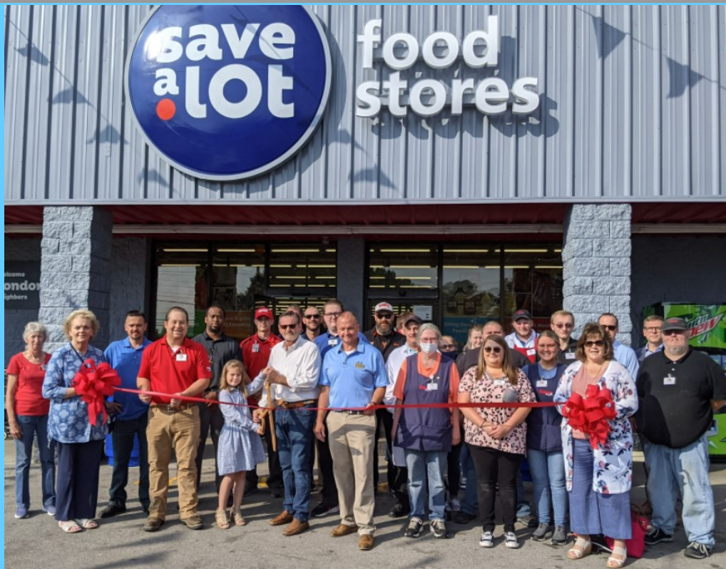
Save-A-Lot Located at 825 South Laurel Road