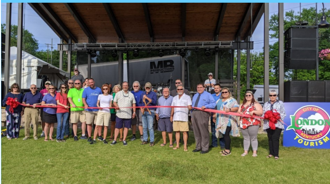
Town Center Park Located at 500 North Main Street