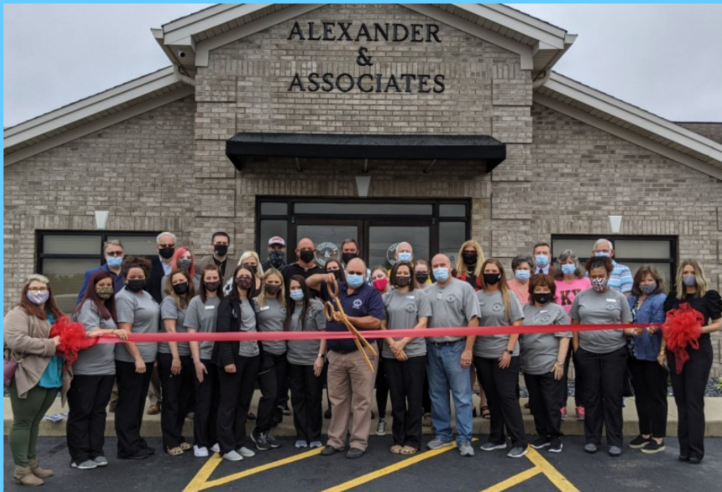
Alexander & Associates Located at 181 Old Whitley Road