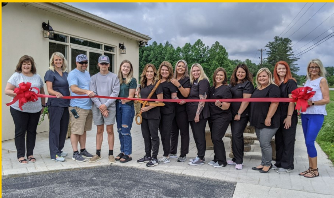
It's Girl Time Studio Located at 4900 South Laurel Rd.