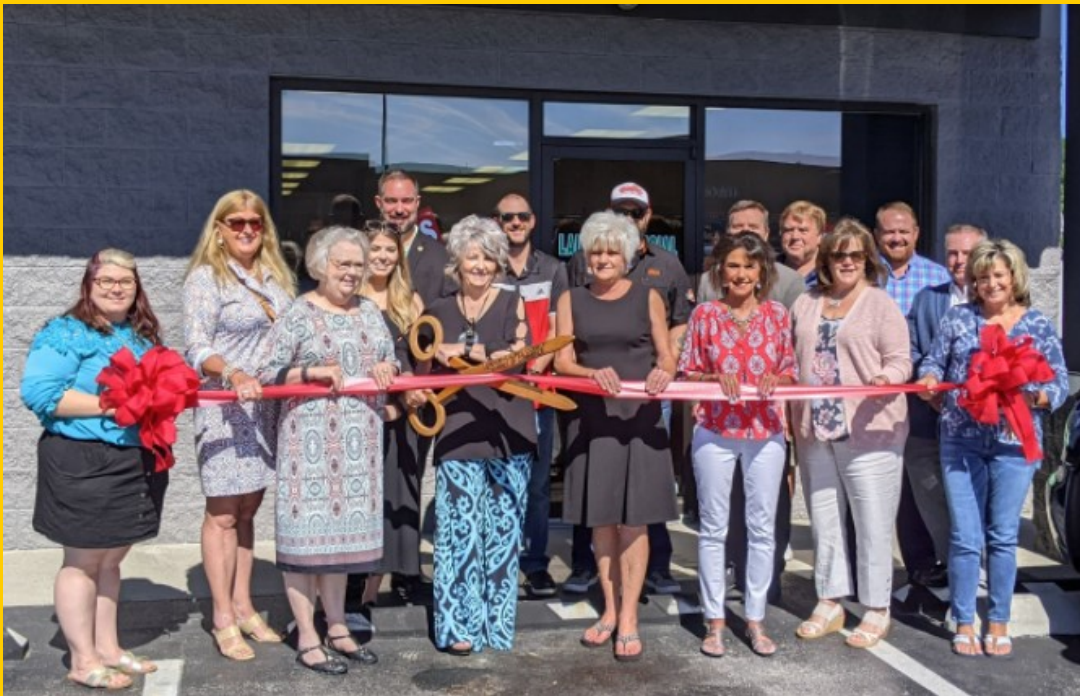
Laurel Financial Company, Inc. New Location at 417 Don's Drive