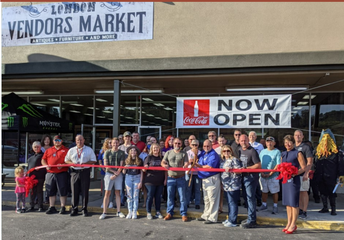
London Vendors Market Located at 845 South Main Street