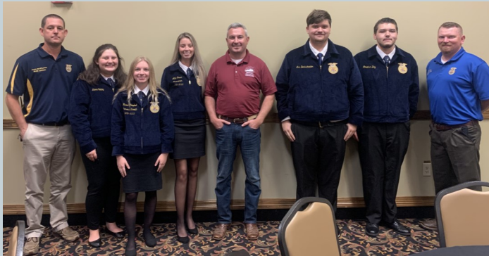
South Laurel High School Future Farmers of America