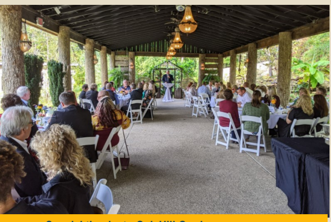
Special thanks to Oak Hill Gardens, our venue.

The Chamber would like to thank the following businesses that donated prizes at our October luncheon. . .