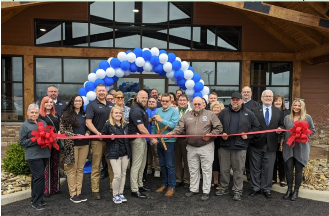
Camping World Located at 325 County Farm Road