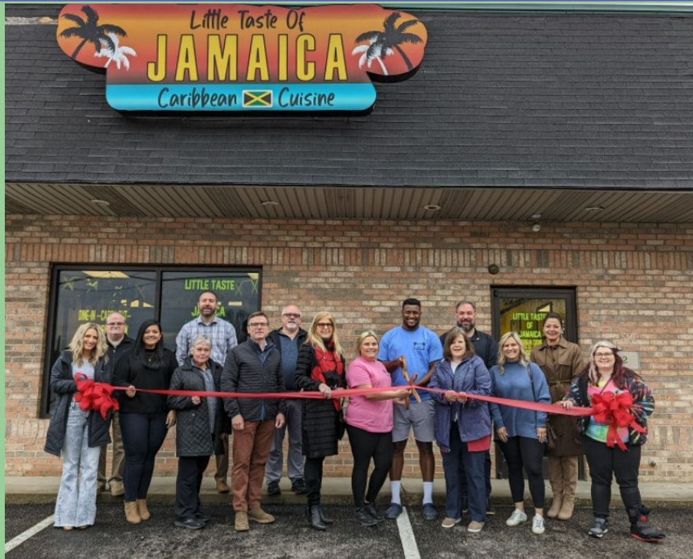
Little Taste of Jamaica Located at 1112 North Main Street