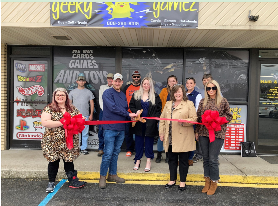
Geeky Gamez Located at 1537 South Main Street