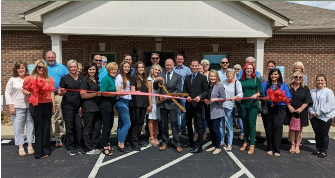
Oakley Chiropractic Center Located at 212 Thompson-Poynter Road