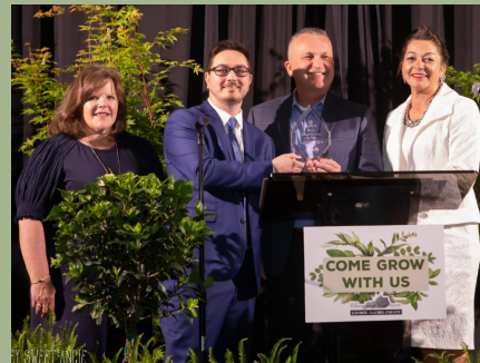
Century 21 Advantage Realty