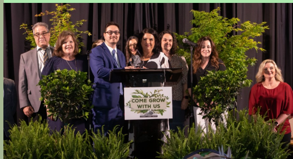
Laurel County Literacy Council