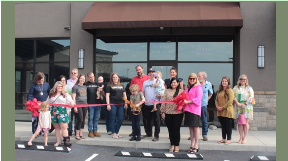
Love is Real Wellness Cafe Located at 100 Bacho Way