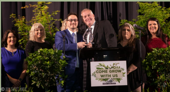
Home Helpers Home Care