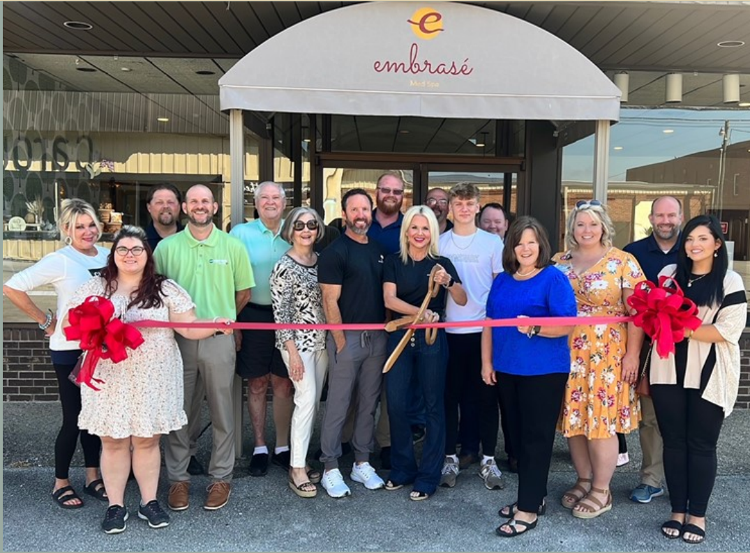
Embrasè Med Spa Located at 202 N. Hill Street