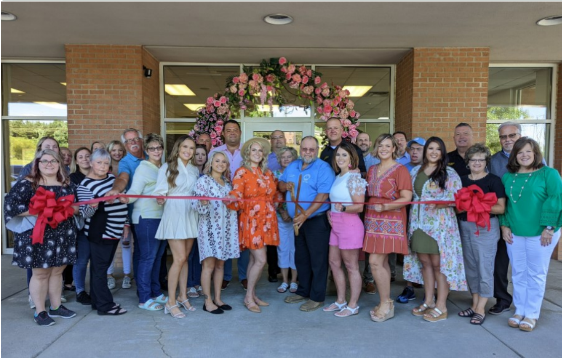
Pink Cashmere Located at 100 Shiloh Drive