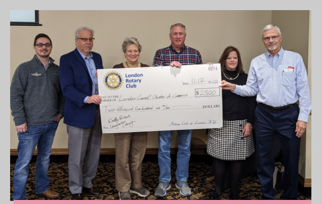
The London Rotary Club presented a check to the London-Laurel Co. Chamber of Commerce Foundation for $2500 in support of the Dolly Parton Imagination Library.