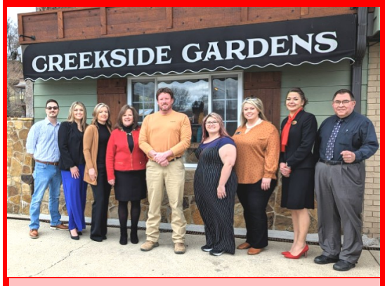
Creekside Gardens 1303 South Main Street

Be on the lookout. . . next month they might be visiting you!