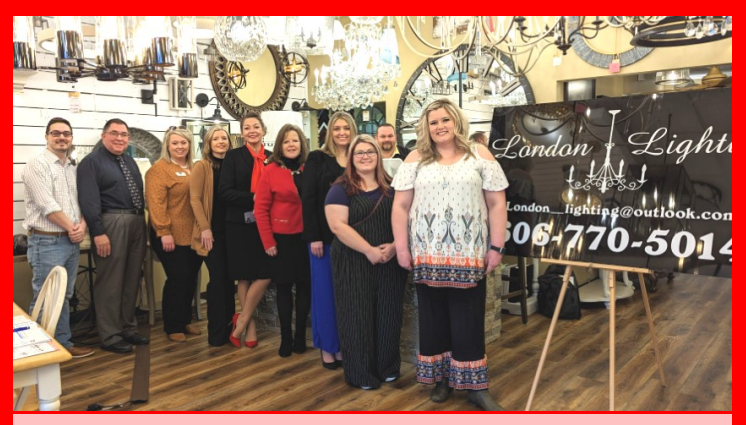
London Lighting 303 Madison Square