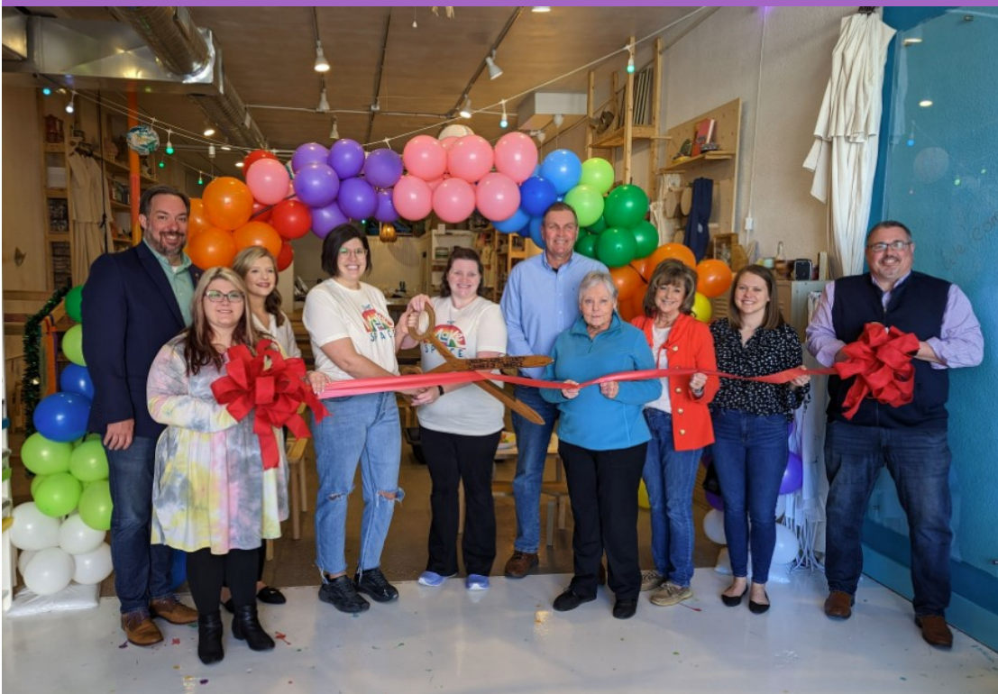
The Make Space Located at 300 North Main Street