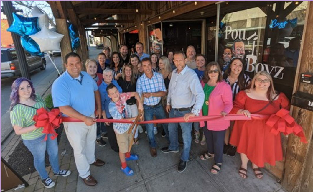
Pour Boyz Sports Lounge Located at 121 North Main Street