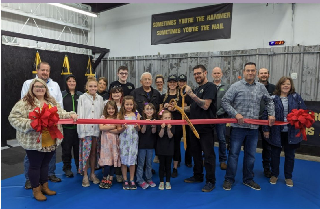
Triple Threat Martial Arts Located at 1413 South Main Street