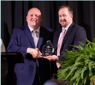
WB Transport LLC