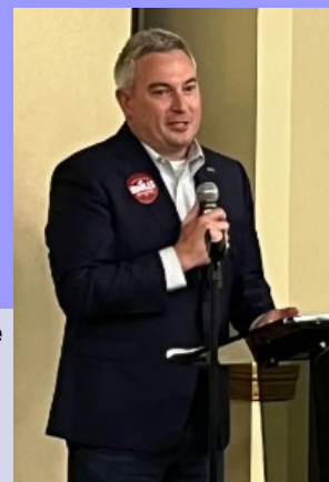
Ryan Quarles, Agriculture Commissioner and Candidate for Governor spoke to the luncheon attendees.

The Chamber would like to thank the following businesses that donated prizes at our April luncheon. . .