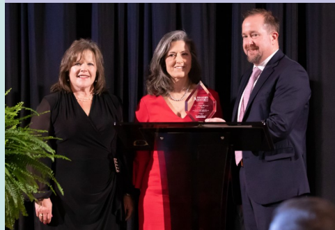
Parkinson's In Motion