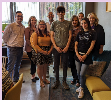
Local Honey 300 North Main Street