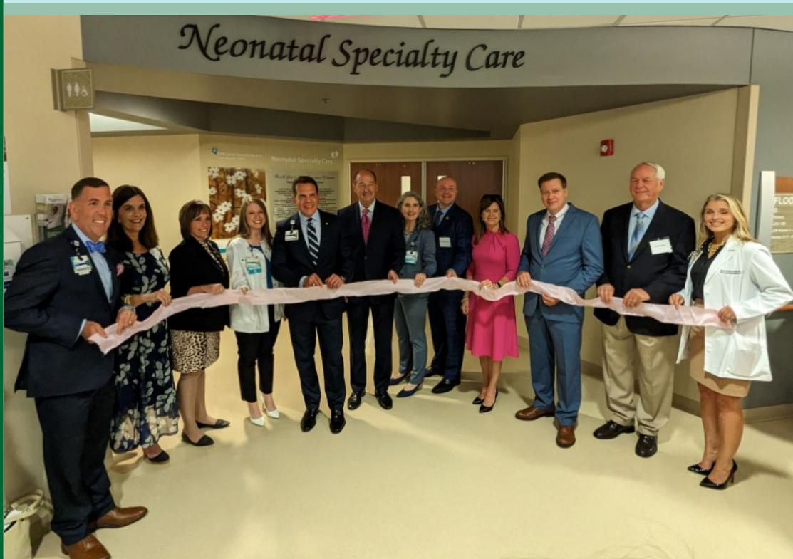
Neonatal Specialty Care Nursery Located at Saint Joseph London