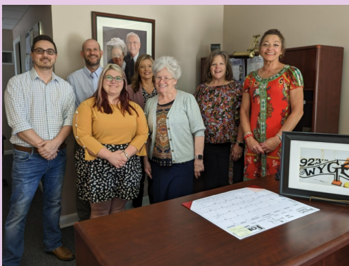
WYGE Christian Radio 201 E. 2nd Street