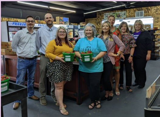
Cornett Farm Fresh 630 Bill George Road