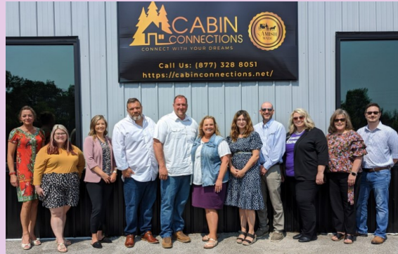
Cabin Connections 2079 N. Laurel Road