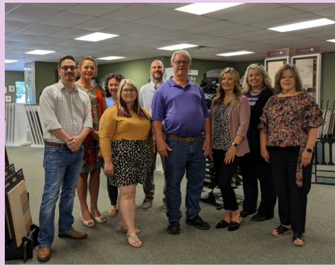
L.G. Design Ltd. 1611 McClain Lane