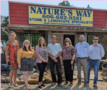
Nature's Way Landscaping 3598 S. Laurel Road

Be on the lookout. . . next month they might be visiting you!