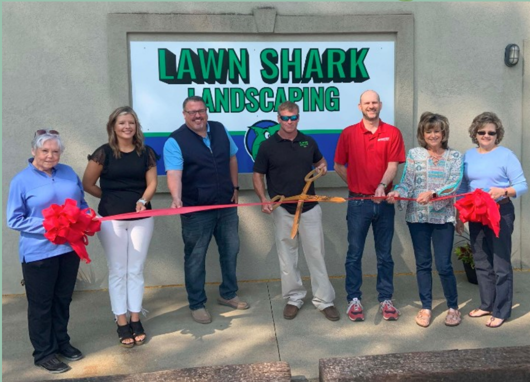
Lawn Shark Landscaping Located at 1081 Barbourville Road