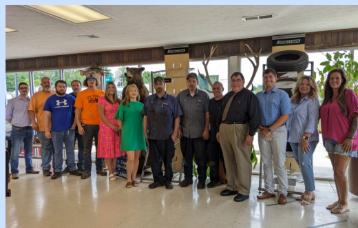
Cook Tire 339 Old Whitley Road