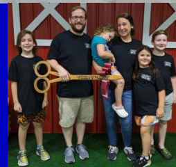
London Children's Museum Located at 100 Bacho Way Suite 650