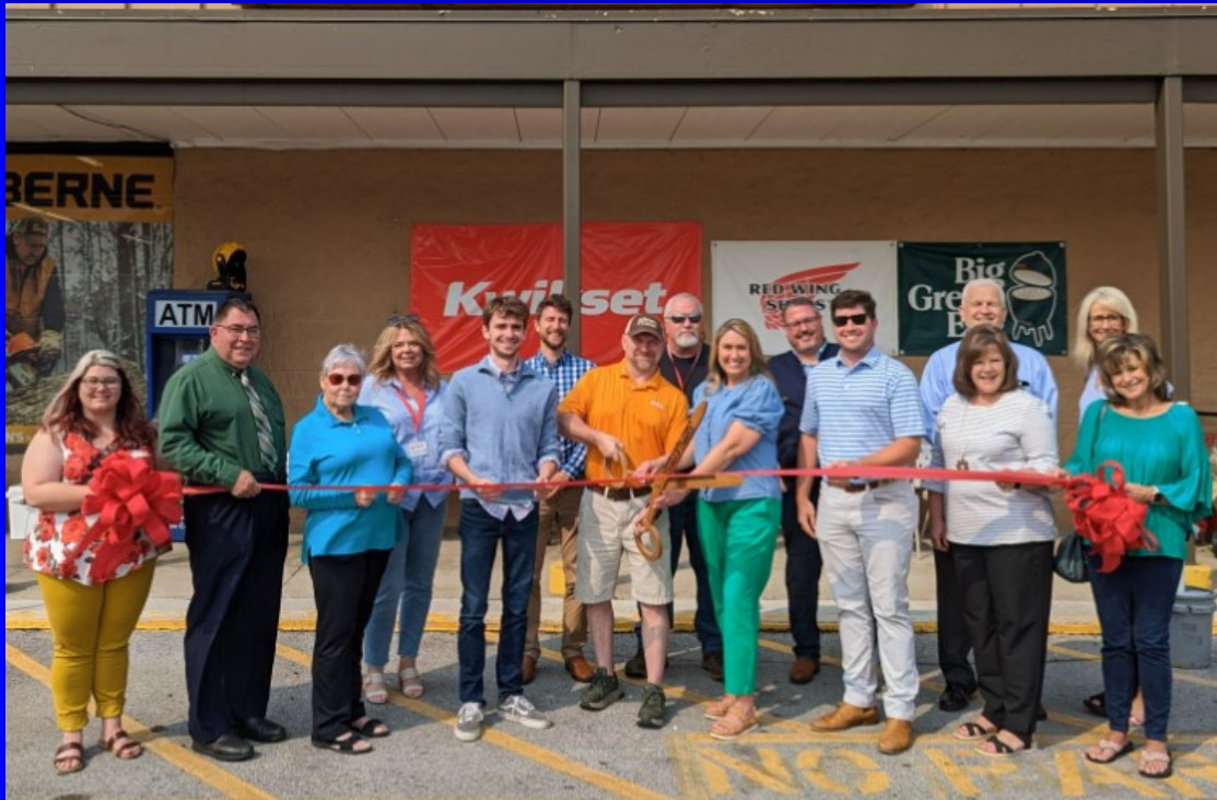
Farmer's Pro Hardware Plus Located at 1807 North Main Street