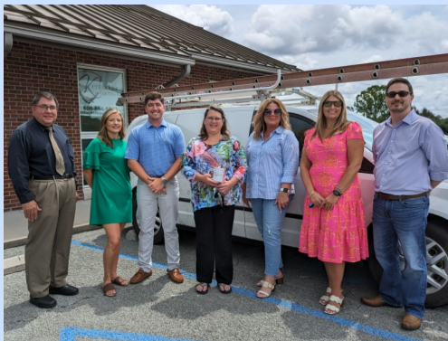
Kentuckiana Alarms 440 Old Whitley Rd.