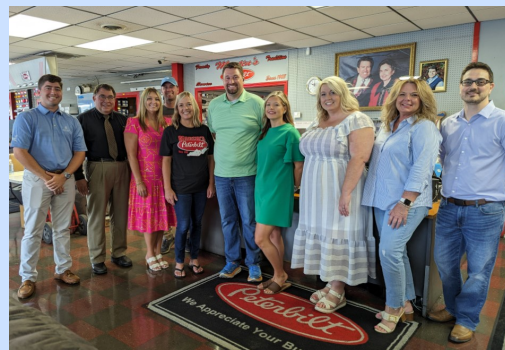
Martin's Peterbilt 174 Old Whitley Rd.