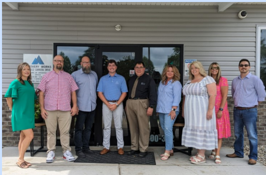
Recovery Works 300 Carrera Drive