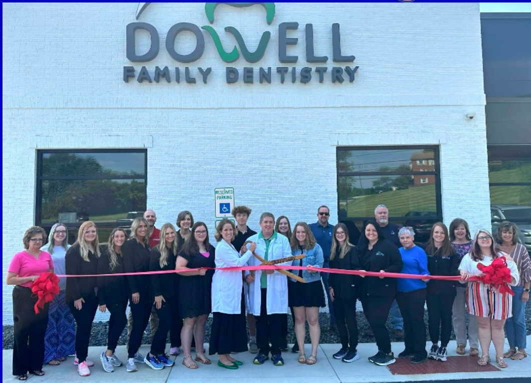
Dowell Family Dentistry Located at 100 Jordan Drive