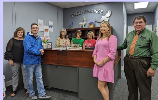
Eagle Finance 1774 Hwy 192