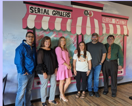
Serial Grillers & Killer Sweets 316 Dog Patch Center