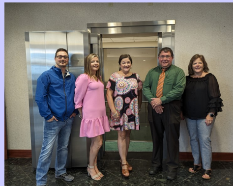
Truist 840 Whitley Street