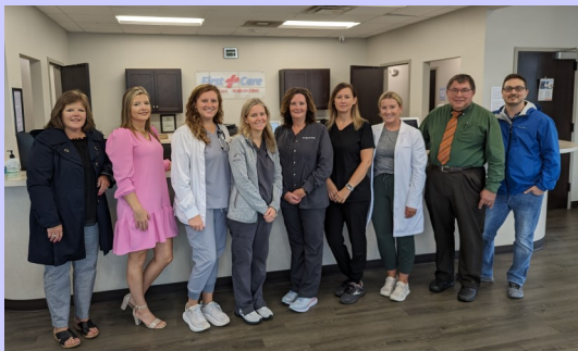
First Care Clinics 1649 KY 192 W