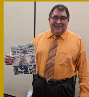
These businesses took advantage of our new 2 for $200 Spotlight promotion: Alzheimer's Association of Greater KY and Southern Indiana and Minuteman Press

The Chamber would like to thank the following businesses that donated prizes at our July luncheon. . .