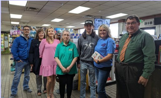
London Auto Truck Center 15 Dog Patch Trading Post

Be on the lookout. . . next month they might be visiting you!