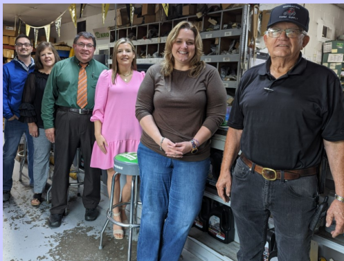
Southeastern Farm Supply 807 S. Dixie Street