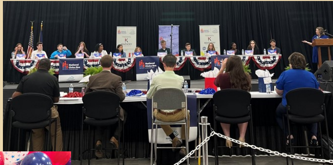
Pictured above: Regional finalists from across the state participate in the Kentucky State Finals.