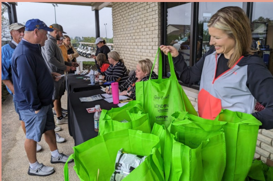
Chamber Ambassadors hard at work!

The Chamber would like to express appreciation to this year's sponsors (page 1) and to the businesses that donated door prizes, goody bag items, snacks and drinks (page 8). We could not be the successful Chamber that we are without the help and support from so many generous members. Thanks to all!