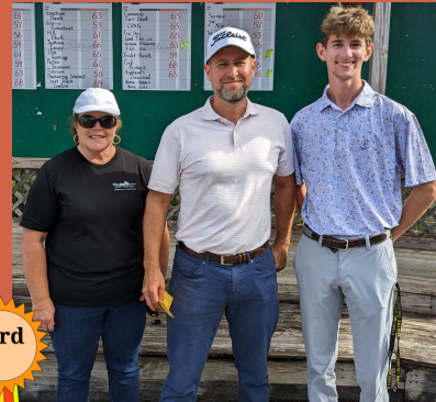
Greene, McCowan & Co.