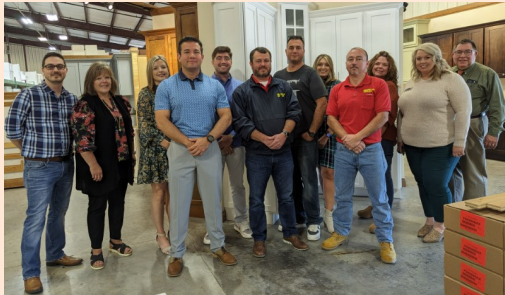
Surplus Sales, Inc. 1551 American Greeting Card Rd.