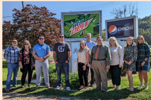
Pepsi-Cola Bottling Company 1010 Cumberland Falls Highway