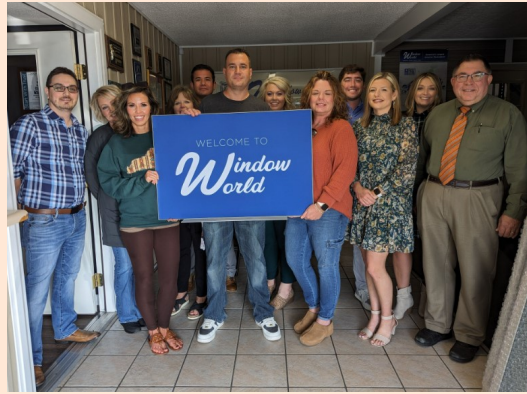
Window World of London 142 American Greeting Card Rd.