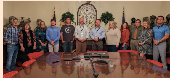
SEKRI 1205 Cumberland Gap Parkway