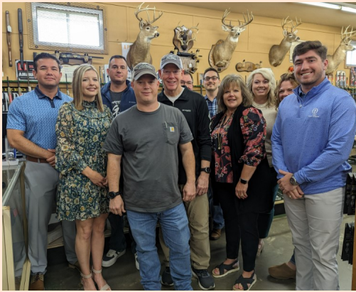
Kentucky Outdoorsman 8833 US Hwy 25

Be on the lookout. . . next month they might be visiting you!