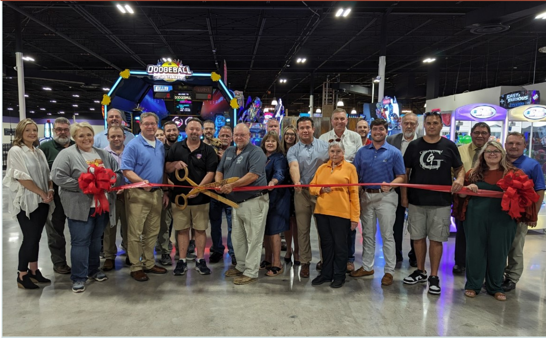
The Party Palace Located at 1803 N. Main St.