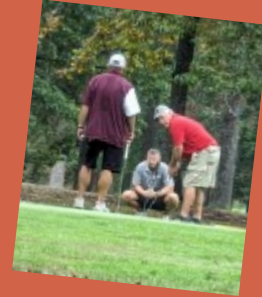
Kinetic by Windstream