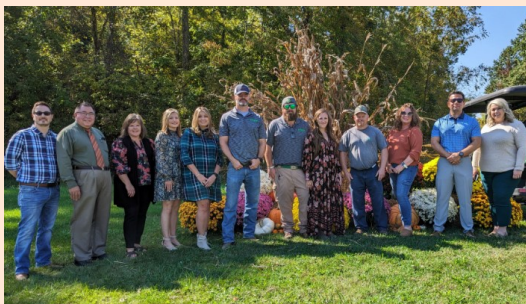
CC&M 1019 Cumberland Falls Highway