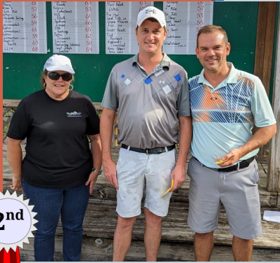
Tim Short Auto Mall