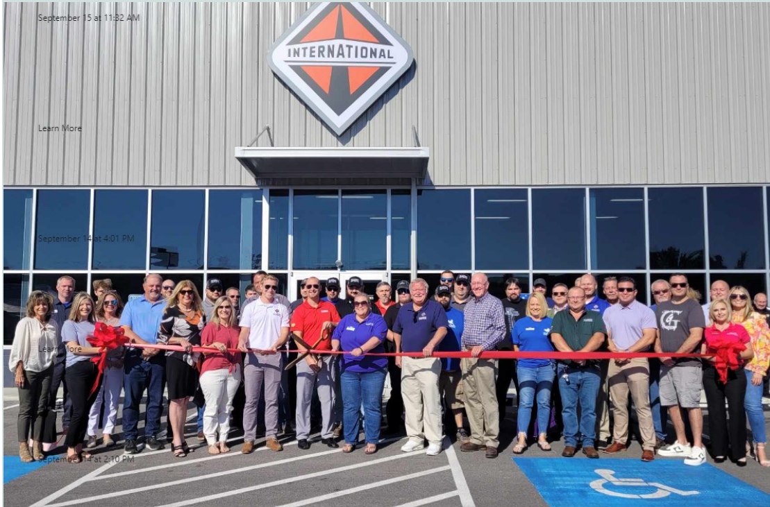
Bluegrass International Located at 202 Faith Assembly Church Rd.