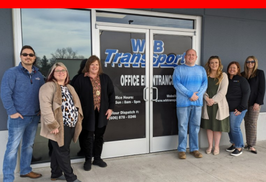
WB Transport 77 Spring Lake Blvd.