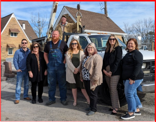
Hampton Monument Services 1482 S. Laurel Road