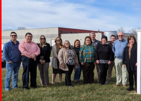
HT Warehousing & Cold Storage 227 Air Park Drive