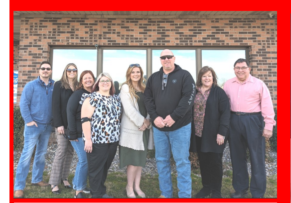
London Corbin Airport 556 Hal Rogers Drive

After a hiatus of almost three years, Chamber Ambassadors are back on patrol! This was our 3rd month back and it was great to surprise a few of our members with a visit and gifts from our Ambassadors. It's always fun to meet with fellow Chamber members and learn more about their business. Be on the lookout. . . next month they might be visiting you!