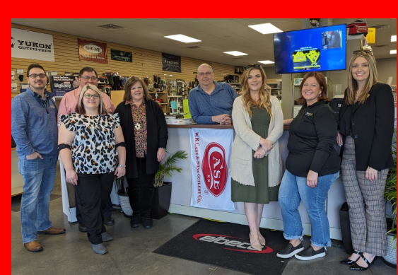
Front Line Public Safety Equipment 1280 South Laurel Rd., Ste. 3