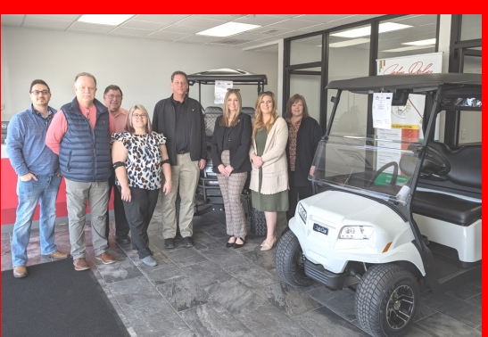
Legacy Nissan Golf Cart Sales 468 South Laurel Road