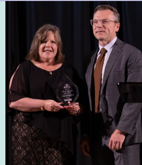
JBK Commercial Roofing