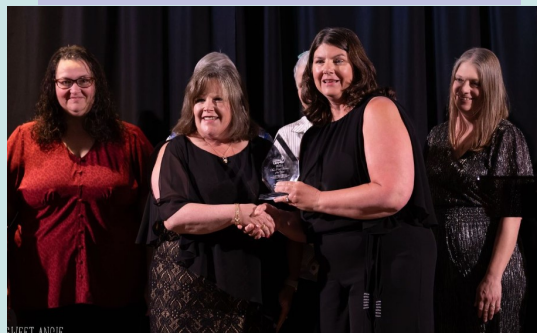
Come-Unity Cooperative Care