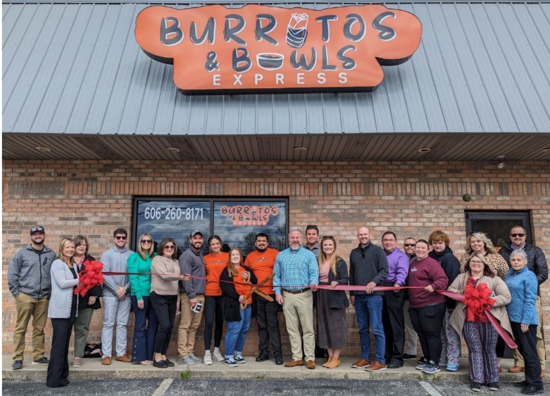
Burritos & Bowls Express Located at 1112 North Main Street