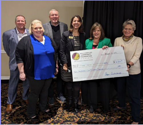
Members of the Upper Cumberland Foundation presented a check for $2500 to the London-Laurel County Chamber of Commerce Foundation in support of Dolly Parton's Imagination Library.