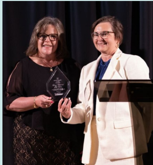
Baptist Health Corbin