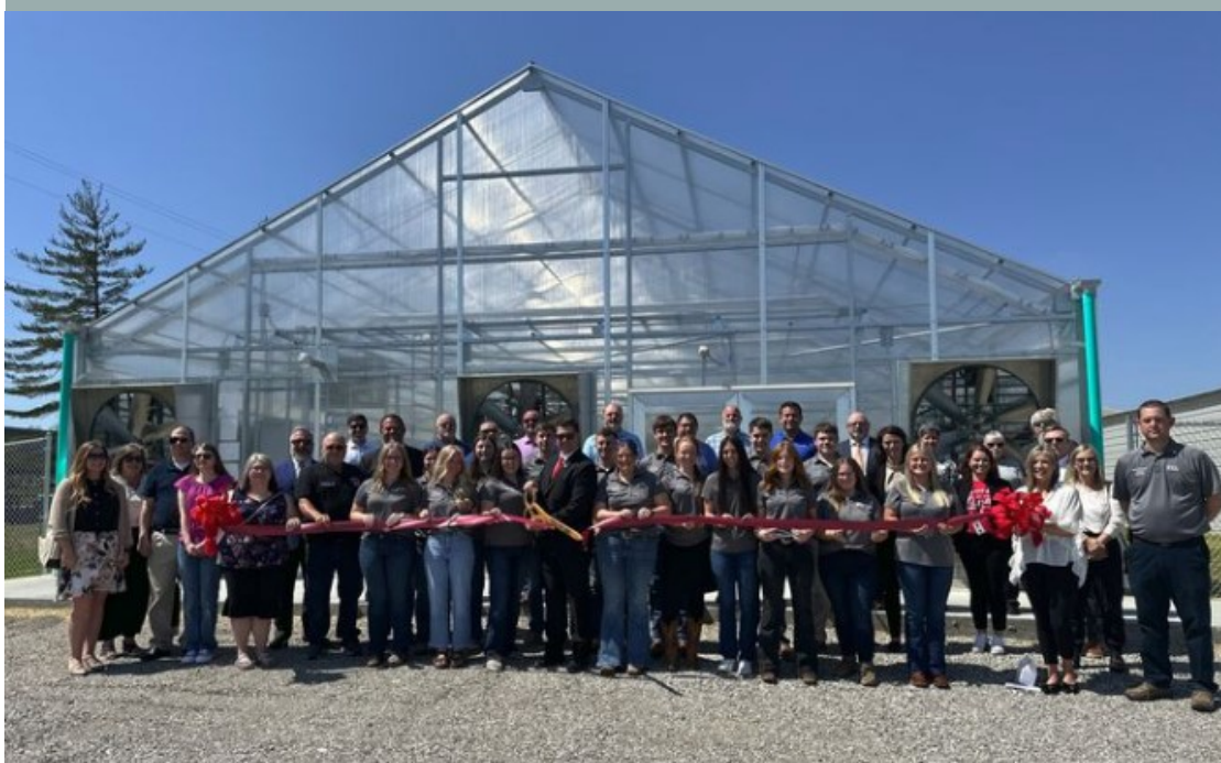
SLHS Greenhouse Located at 201 South Laurel Rd.