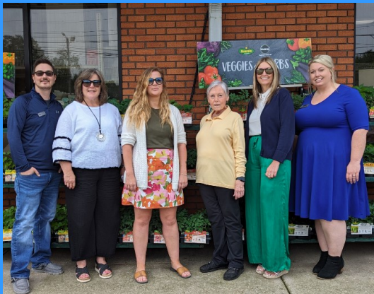
Benge Farm Supply 870 East Fourth Street