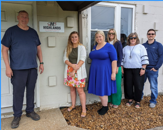
Highlands Diversified Services 250 Highlands Diversified Drive