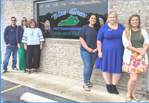
Blue Grass Pest Management 444 McWhorter Road

Be on the lookout. . . next month they might be visiting you!