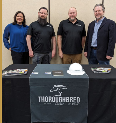
Thoroughbred was our April luncheon sponsor.