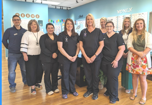
Professionals in Eye Care 356 McWhorter Road, Suite 1