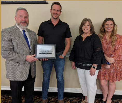
CN Studio Cody Nottingham