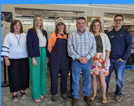
God's Pantry Food Bank 1215 East 4th Street