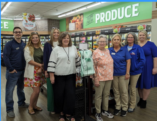
E.C. Porter Store, Inc. 714 East 4th Street