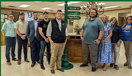
Forcht Bank 100 First Financial Drive