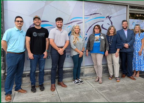
Unbridled Healthcare 222 North Main Street

Be on the lookout. . . next month they might be visiting you!