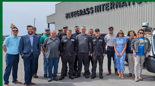
Bluegrass International 202 Faith Assembly Road