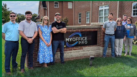
My Office Tech 609 North Main Street