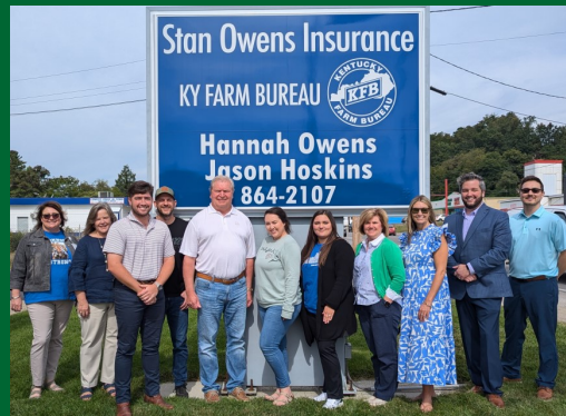
Stan Owens Insurance Agency 819 North Main Street