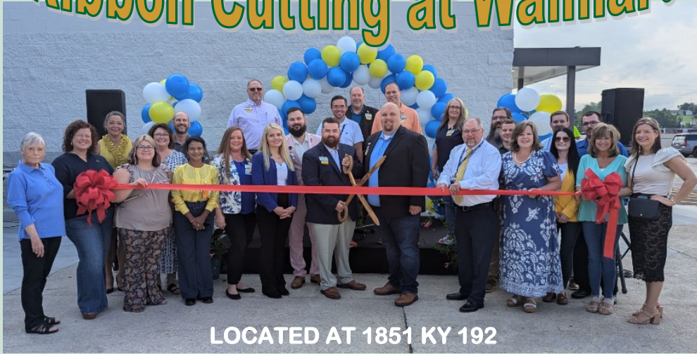
LOCATED AT 1851 KY 192

Our team of providers have extensive experience in treating a wide range of mental health conditions, including depression, anxiety, bipolar disorder, ADHD, Autism and more. We are committed to providing compassionate care and ongoing support to our patients.