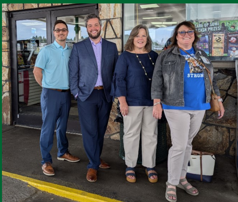
London Travel Plaza 15 Dog Patch Trading Center