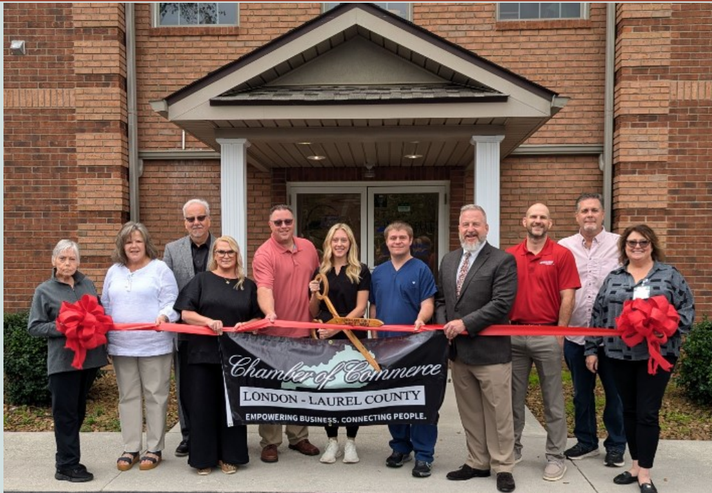
Kentucky Eye Institute Located at 130 Thompson Poynter Road