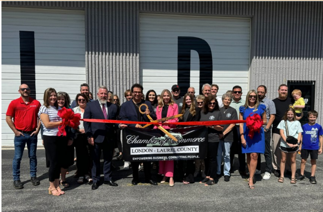
The Backdrop by JD Located at 740 E. Laurel Road