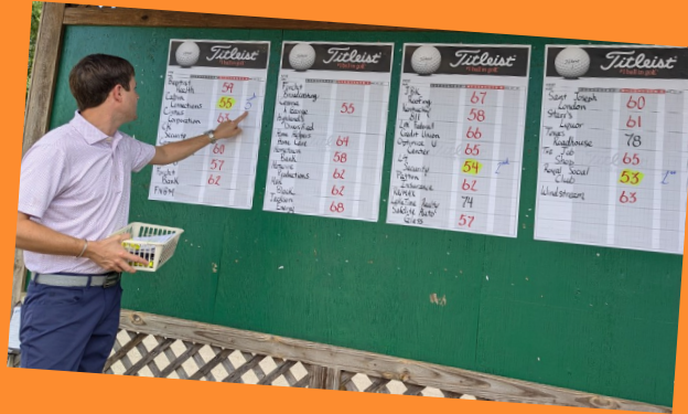
The Royal Social Club