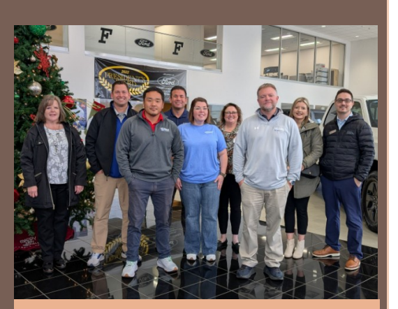
Don Franklin Ford Lincoln LLC 245 KY Hwy 192