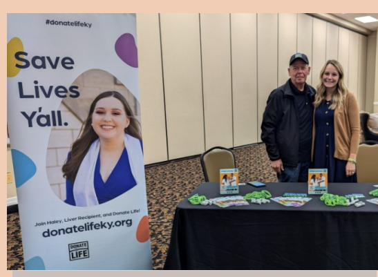
Our luncheon program focused on Donate Life Kentucky.