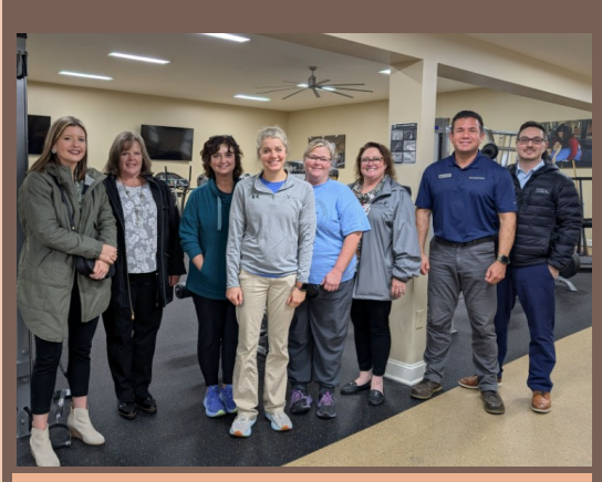
PT Pros 1690 KY Hwy 192