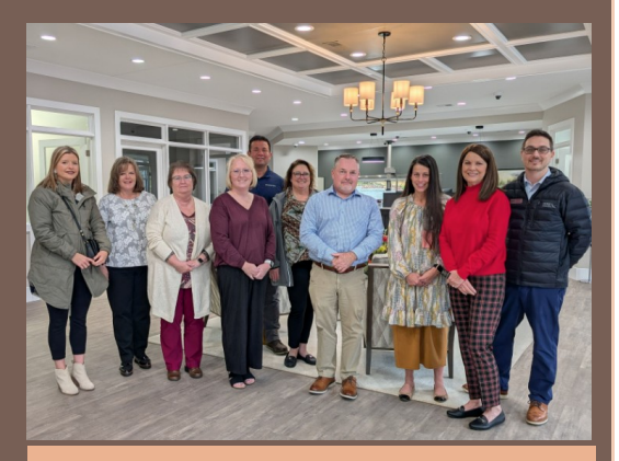
Monticello Banking Company 1006 West 5th Street