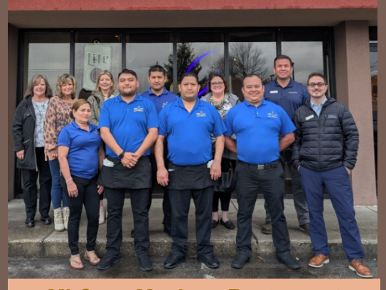
Mi Casa Mexican Restaurant 1740 KY Hwy 192