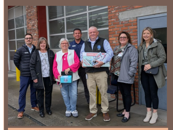
Ambulance Inc. of Laurel County 420 West 5th Street

Be on the lookout. . . next month they might be visiting you!