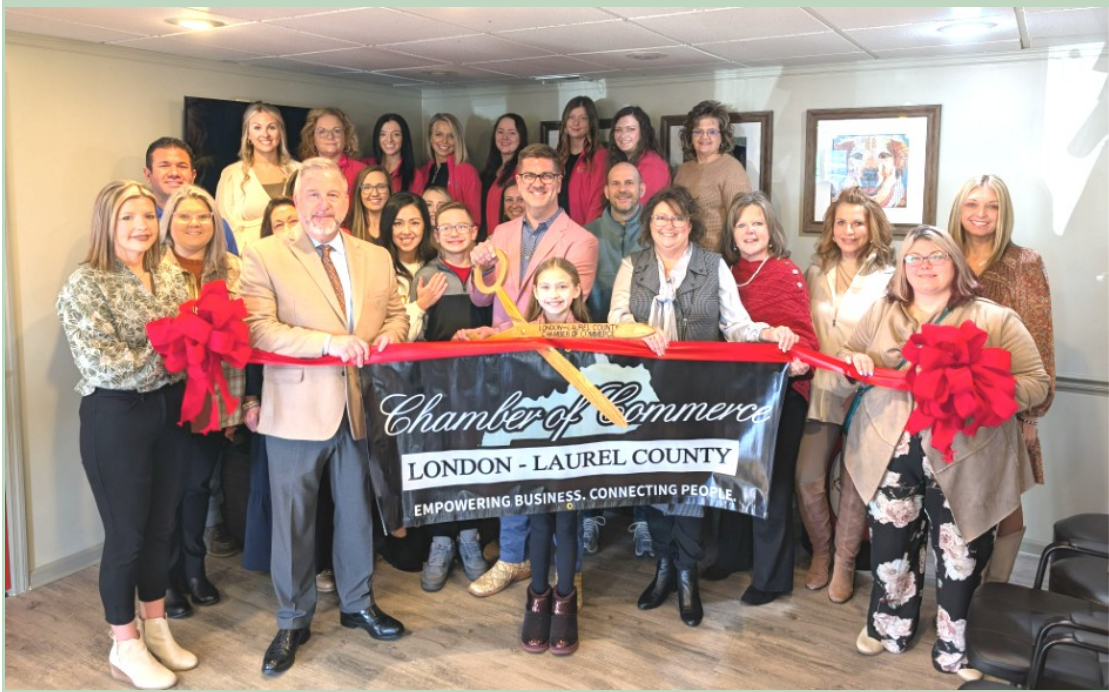
Farmer Pediatric Dentistry of London Located at 1675 South Main Street