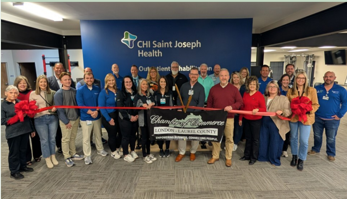
CHI Saint Joseph Health Outpatient Rehabilitation Located at 100 London Mountain View Dr. Ste. 400