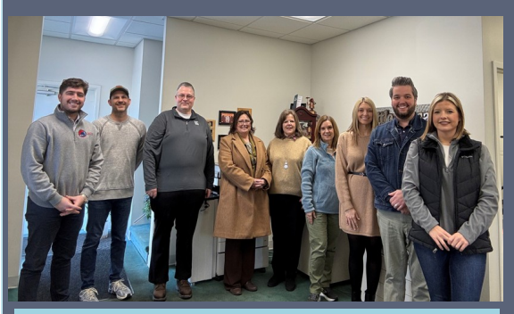
MRK Enterprises—Little Caesars 1000 East 4th Street