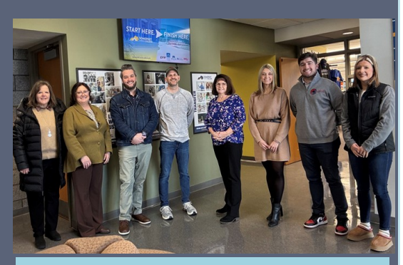
Somerset Community College 100 University Drive