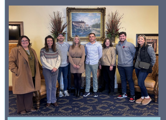
House-Rawlings Funeral Home 510 East 4th Street