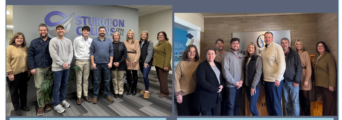
Sturgeon Collins CPA's PLLC 1384 Hwy 192 Suite 100

Be on the lookout. . . next month they might be visiting you!