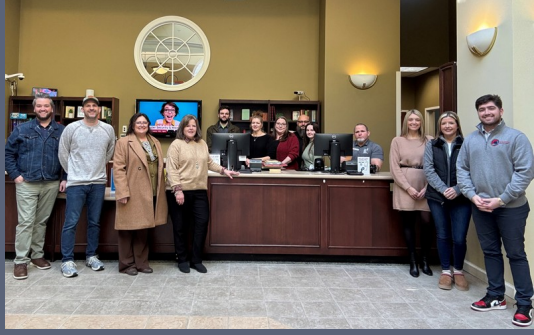
Laurel County Public Library 120 College Street